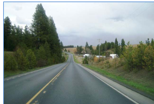
Idaho 8 Corridor

The Idaho Transportation Department (ITD) contracted with a consultant to conduct a comprehensive review of existing Idaho State Highway 8 (Idaho 8) corridor conditions. The review identified deficiencies related to traffic operations, roadway geometry and cross section, access control, and safety with an overall purpose to identify and prioritize operational improvements over a 10-year period. FHWA's IHSDM was used to evaluate existing traffic, roadway geometry, and predict crashes using these and the corridor's recent crash history.