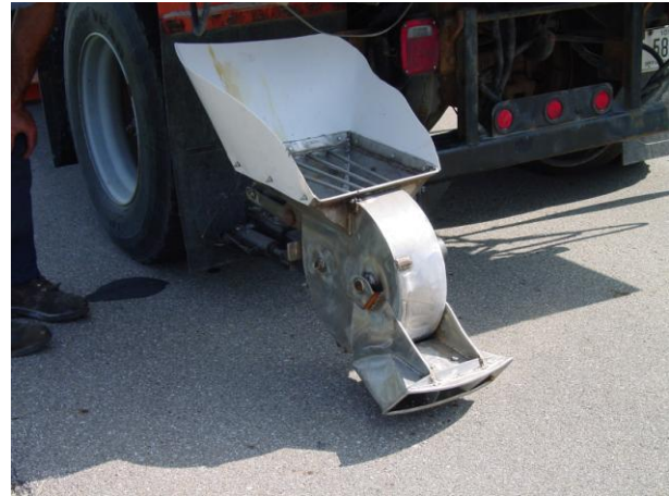
Figure 1: One Type of Zero-Velocity Spreader.

The purpose of this study was to investigate various methods of applying abrasives to roads in winter weather. Abrasives increase friction on the road surface for a period of time, and the ultimate goal of the research was to enhance friction on the road for as long as possible.