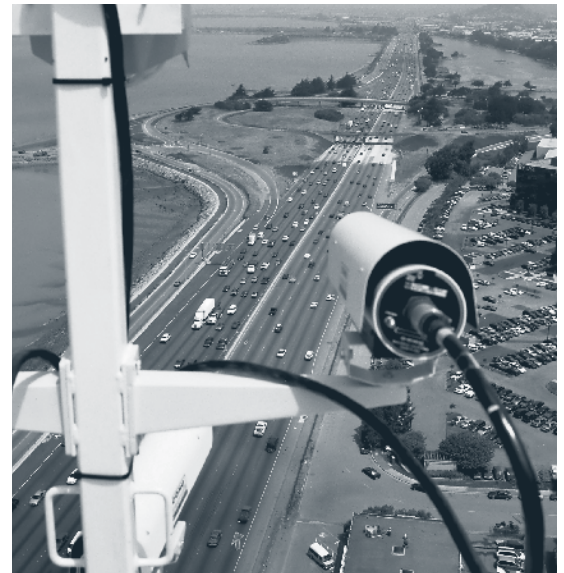
Figure 2. A digital video camera mounted on top of a building that overlooks a highway is recording vehicle trajectory data.

As a result of the core simulation algorithms developed through NGSIM ultimately being incorporated into commercial simulation models, transportation practitioners will be able to use