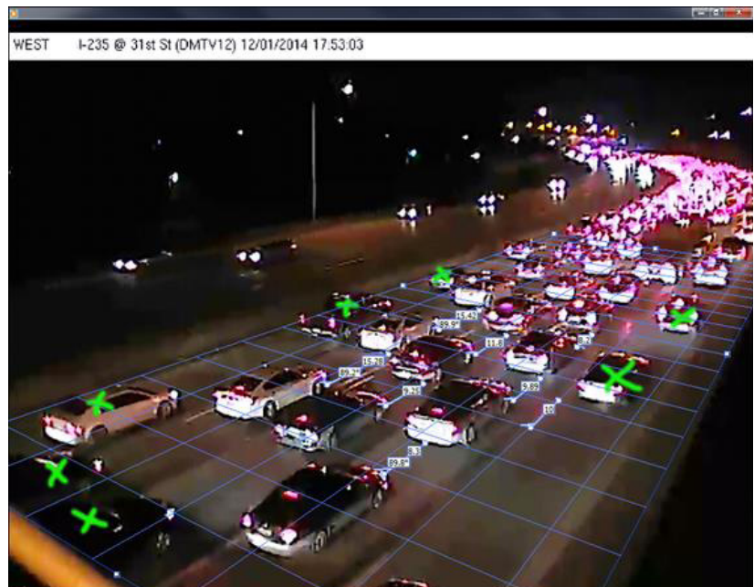
Camera image processed to obtain standstill distance measurements

Two crucial inputs to calibrate VISSIM are standstill distance and headway. Standstill distance, the distance between stopped vehicles, indicates the maximum traffic density on a roadway section, in that vehicles are as close together as possible. Headway, the elapsed time between the front bumper of the leading vehicle and the front bumper of the following vehicle, indicates the capacity of a roadway section; when all vehicles are at their headway, any additional traffic density causes vehicles to begin braking, which in turn causes congestion. Time gap is similar but is defined as the elapsed time between the back bumper of the leading vehicle and the front bumper of the following vehicle.