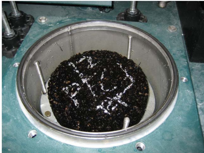
Filled pressure chamber.

4.6 Fill the pressure chamber completely with water until it is just overflowing.