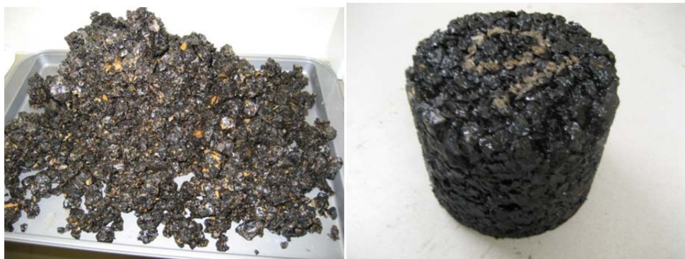
Sample with major stripping and very high swell (left) and sample with no stripping and very low swell (right).

The above are acceptance criteria. The mix is considered to fail if it does not meet one or more of these criteria. With some PFC's are shown below the samples do very poorly in this test.