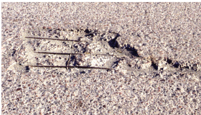
Sutter et al. 2002

The passivated layer can also be compromised by carbonation of the HCP as a result of exposure to atmospheric carbon dioxide ( CO_2 ), which can reduce the concrete pH, making the passivated layer unstable. Cracking in the concrete cover facilitates penetration of chloride-bearing fluids as well as CO_2 causing corrosion to be accelerated.