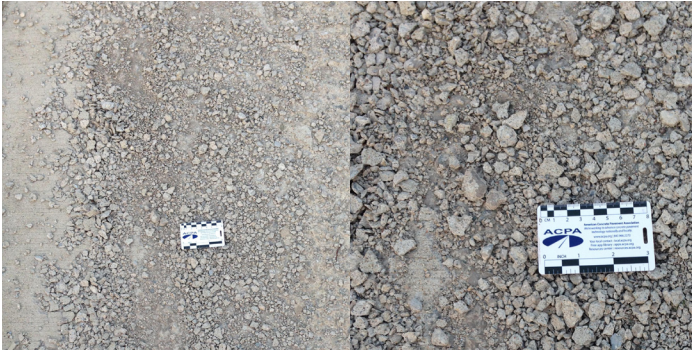
Deicer scaling showing the intact surface on the far left side of the image (left) and close-up of the scaling (right)