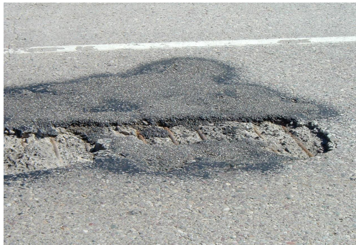
Sutter et al. 2002

Corrosion of embedded steel where cover layer has spalled