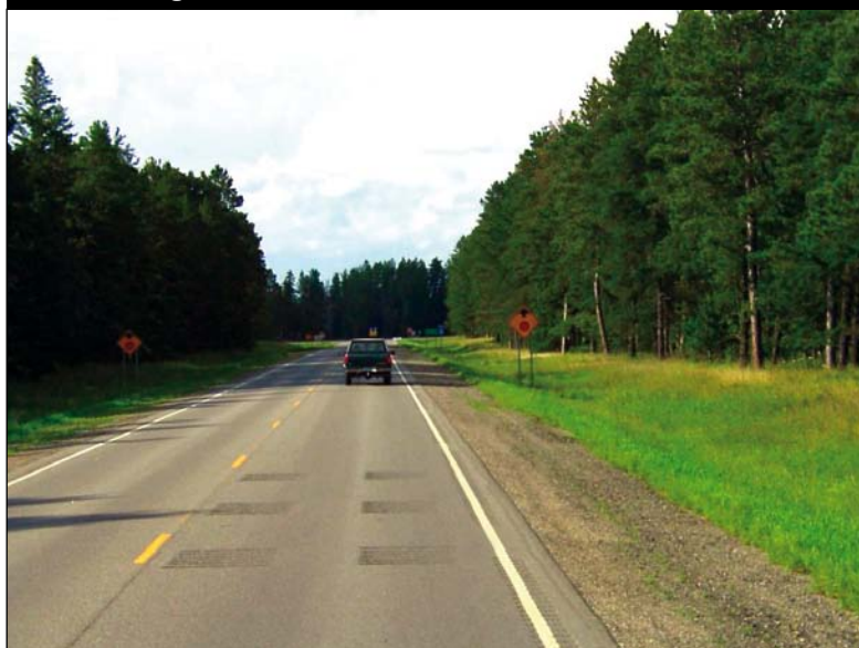
Figure 1. TRs on a rural road in Minnesota.