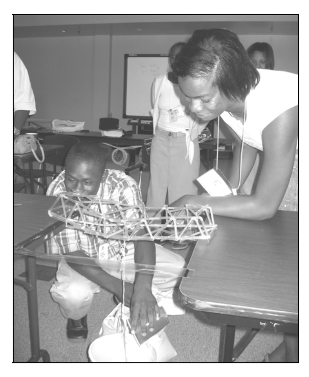
Figure C-2 ATI-04 Students testing "pins and straws" bridge