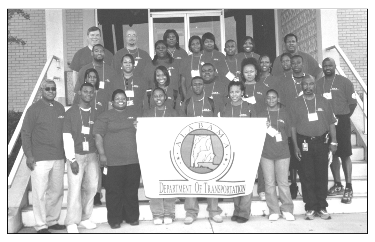
Figure C-1 ATI-04 Students at ALDOT 4<sup>th</sup> Division offices