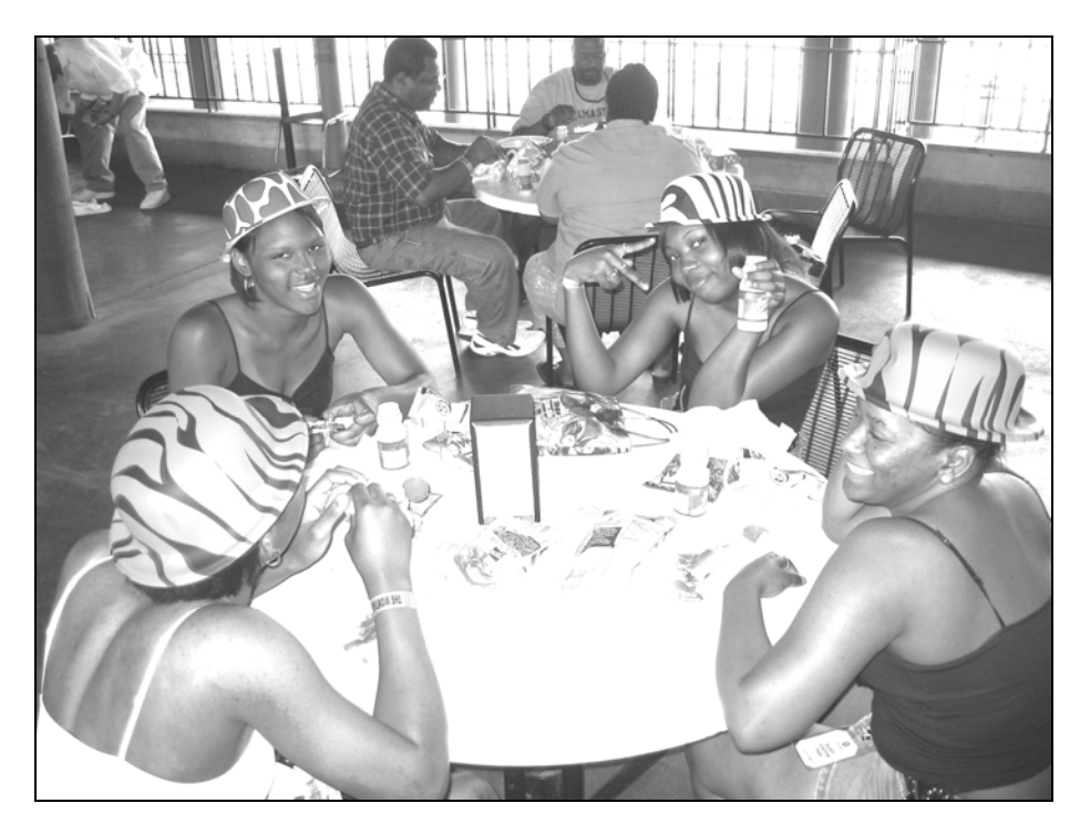
Figure C-4 Look who "escaped" from the zoo