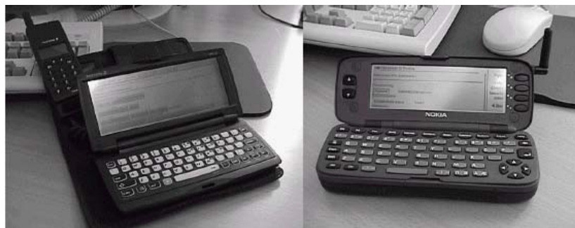
Figure 2-2. PROMISE ATIS devices: Ericsson MC 12 (left) and Nokia 9000i

provided through a mobile device, in some instances two mobile devices. Examples of these devices are pictured in Figure 2-2. The devices can access the Internet for or receive text messages about a variety of information, including trip planning information, travel information, yellow pages, bus stop timetables, maps, and flight delays. However, not all the information is available for the devices in each of the different locations, as the service providers differ among countries.