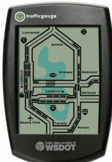
Figure 2-3. TrafficGauge Mobile Device

In addition to the currently operating projects that have been operating for several years, other products are emerging to help travelers receive information. One is TrafficGauge, shown in Figure 2-3, a mobile device that displays the WSDOT traffic flow map on a small screen. Instead of color, it uses solid and blinking lines to identify congested traffic areas on the state's Puget Sound freeway network. The data are provided by the WSDOT and are broadcast every 4 minutes to each of the devices. Drivers can mount the device in their car or take it with them to check on traffic conditions (TrafficGauge 2003).