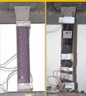
Sensing layer only 'Structural-sensing' layer

Exploratory Advanced Research . . . Next Generation Transportation Solutions