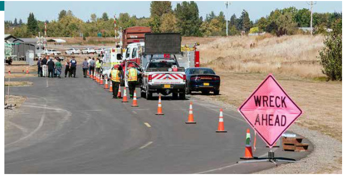
Above: Traffic Incident Management.