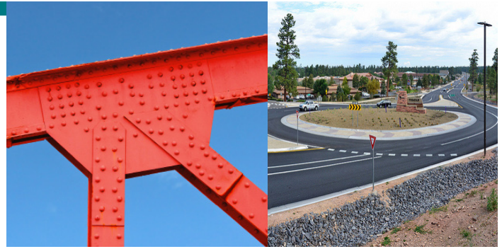
Left: Gusset plate. Right: Roundabout.

provided to stakeholders about the program.