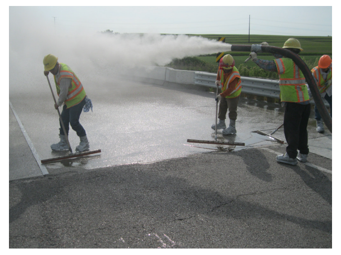
Spreading polymer and blowing flint chips on the Keg Creek Bridge deck

At Keg Creek, the aggregate was cast via a vacuum and blower; whereas, at the Johnson County bridge, the aggregate was cast via a more labor-intensive hand broadcasting method.