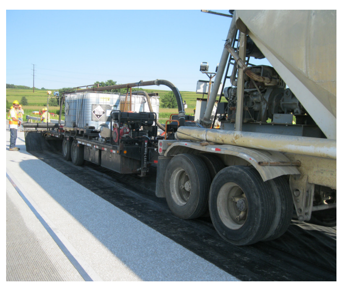
Semi-truck and trailer carrying hopper of flint chips, vats of epoxy polymer, and a blower on the Keg Creek Bridge

The deck preparation was completed similarly by shot blasting the deck to an approved surface roughness and blowing the deck free of debris. The blowing process differed slightly, but it appeared that the same result was achieved.