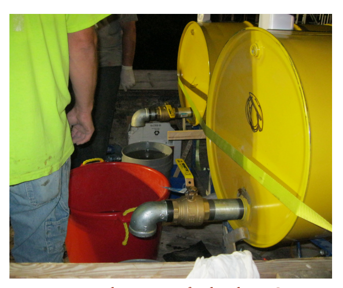
Two-part epoxy polymer mixing for the Johnson County bridge deck

The epoxy polymer for the Keg Creek Bridge deck was precisely measured using automated controls; whereas, the material used on the Johnson County bridge deck was closely approximated by dispensing each part into equally sized muck tubs.