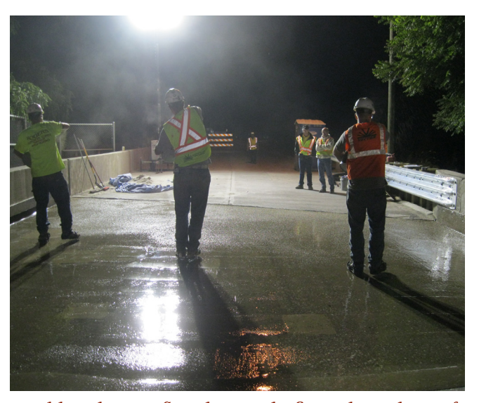
Hand-broadcasting flint chips on the first polymer layer of the Johnson County bridge deck