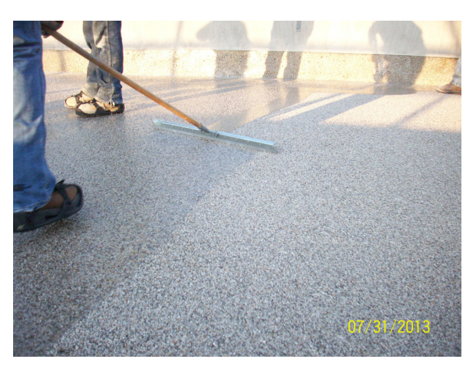
Spreading second layer of polymer on the Johnson County bridge deck

Over time, each overlay has generally performed quite well with only a few areas of exception. It is believed that these localized areas likely underperformed due to poor deck preparation, improper polymer mixing, snowplow impact, or a combination thereof.