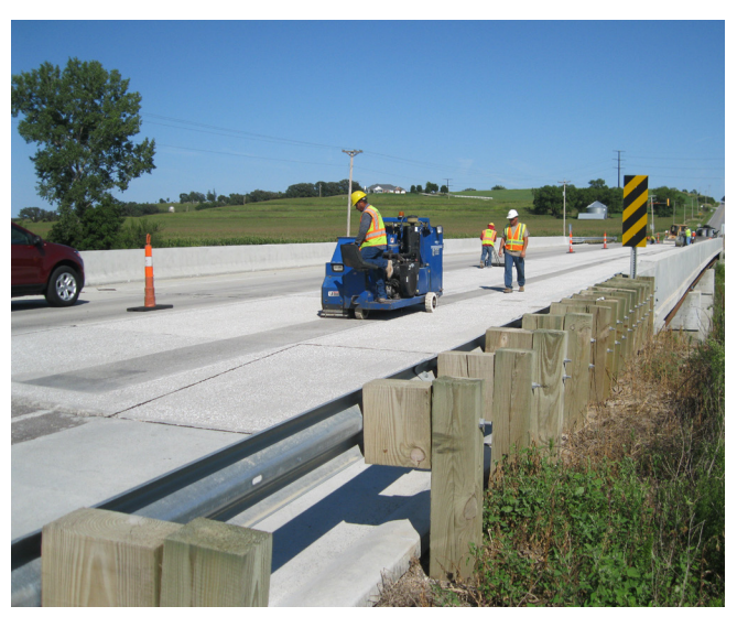
Shot blasting (and vacuuming) the Keg Creek Bridge deck to achieve deck surface relief as part of initial preparation

The two bridges—a Johnson County, Iowa bridge over I-80 on 12th Avenue in Coralville, and the Keg Creek Bridge on Hwy 6 in western Iowa, 10 miles east of Council Bluffs—were overlaid during the summer/fall of 2013. The process by which each bridge was overlaid was similar in many ways, although a few slight differences existed.