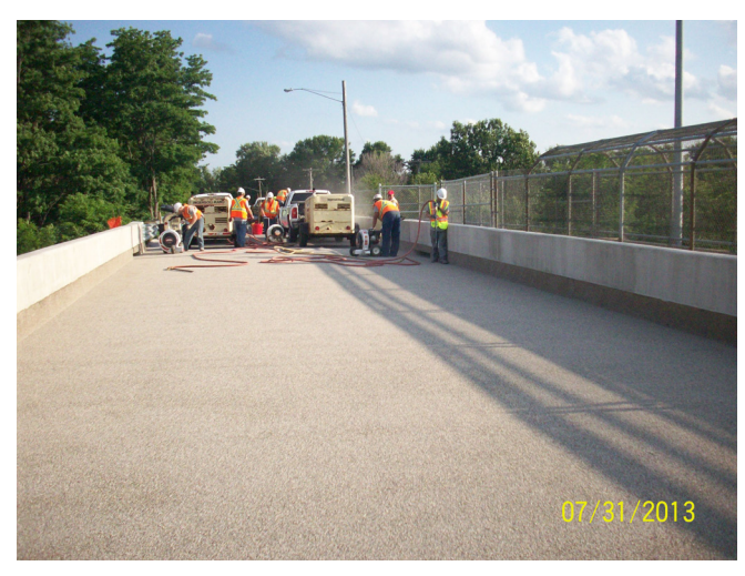
Second layer deck preparation on the Johnson County bridge deck

Any epoxy polymer used will have a specified method of measurement and mixing. These methods are backed by the manufacturers' own research and should be strictly followed to ensure the polymer is properly prepared for deck application. Without proper mixing, the polymer effectiveness could be compromised, resulting in a premature failure of the overlay.