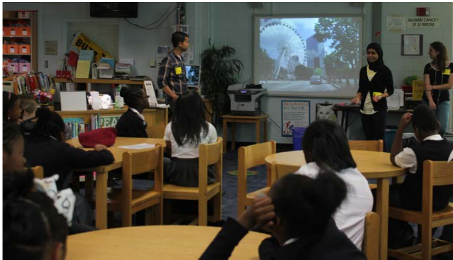
Figure 3-3. Roadway Environments.

After the opening roundtable discussion, the researchers presented several photographs of real world roadway environments from California and Georgia under different environmental conditions. The students were asked to rate each photo on a scale of 1 to 5, with 1 as least complex and 5 as most complex. A sample image can be seen on the screen in Figure 3-3.