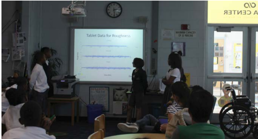
Figure 3-2. Student Accessibility Presentation.

automated vibration data. Figure 3-2 shows the students presenting their data from the tablet accelerometer data collection organized in a separate graph for each location.