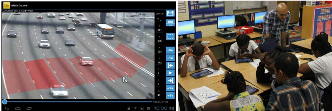
Figure 3-4. Georgia Tech Application for Vehicle Counting on Smart Tablets in Use by Centennial Academy Students.

Heards Ferry Road and Riverside Drive in Sandy Springs, Georgia. This was an actual intersection that the researchers had video data on at Georgia Tech. The students were asked to watch a 15-minute long video of the intersection and to collect vehicle volume data in two ways: 1) by the manual counting method and 2) the video-and-tablet counting method (5) as seen in Figure 3-4.