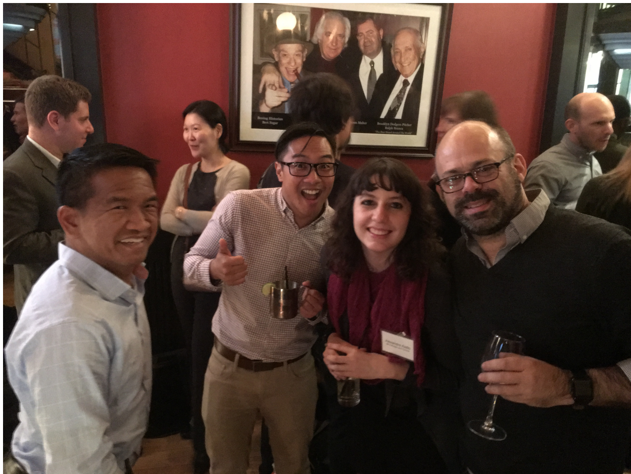
Figure 7: Networking reception with program alumni