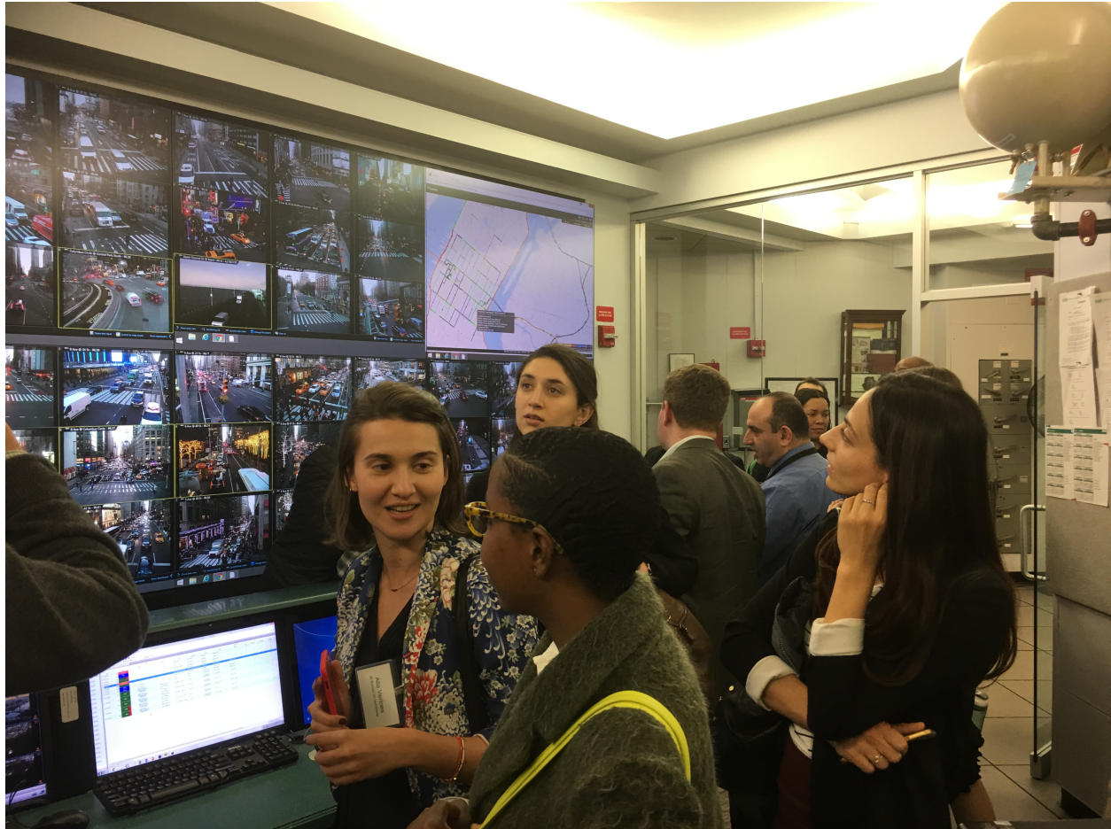
Figure 5: Emerging Leaders touring the NYC DOT Traffic Management Facility

Following lunch, the Emerging Leaders toured the NYC Department of Transportation's Traffic Management Facility. The group learned about coordinating traffic data with video observations, rerouting around disruptions, and coordination with other city and regional agencies.