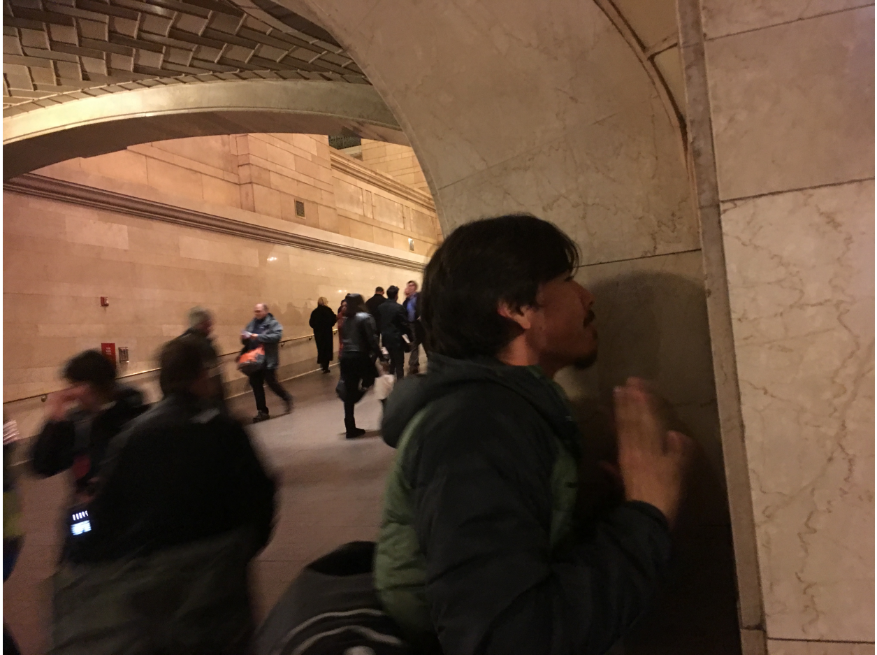
Figure 6: Experiencing the Whispering Wall at Grand Central Terminal