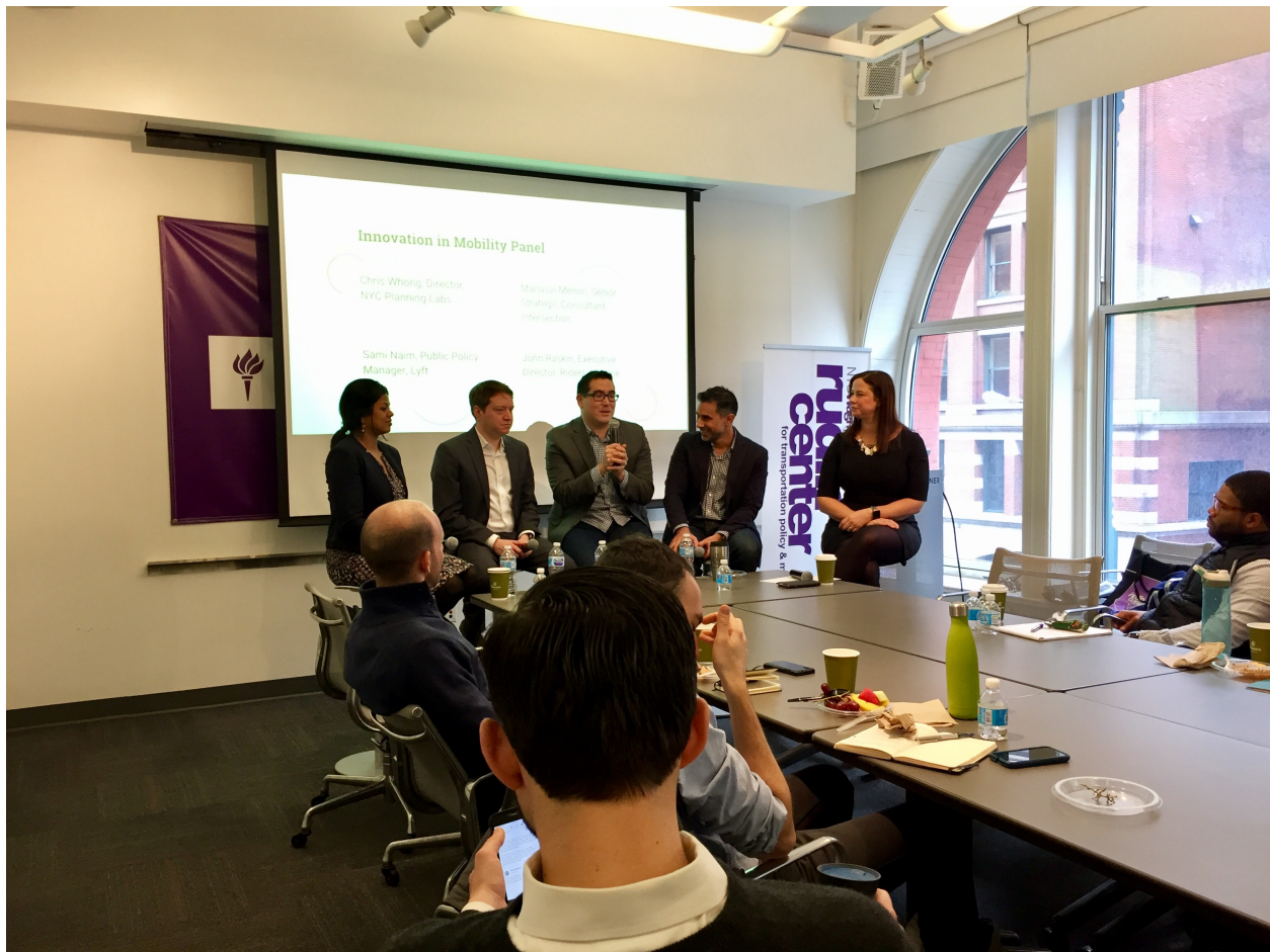
Figure 8: Innovation in Mobility panel

The group discussed the role of the private sector, equity in public services, improving public communications, and extending hobbies into the workplace.