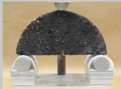
Figure 2 SCB setup

processes has also been developed to be maintained by the DOTD Materials section. In addition, a procedure for qualifying new manufacturers of WMA additives and processes for inclusion in the approved list was developed.