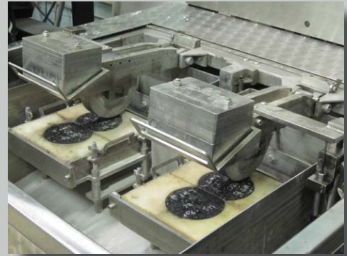
Figure 1 LWT test setup

Based on the findings and the results of this project, specification recommendations were developed and communicated to the DOTD Asphalt Specification Committee. Several rehabilitation projects included those specifications as special provisions. DOTD has adopted permissive specifications to be included in the 2016 Standard Specifications for Roads and Bridges Manual . An approved list of WMA additives and