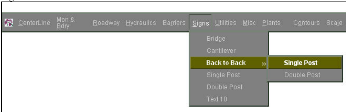
Figure 2: ADOT CADD Webmenu Interface

Preparation consisted of coding menus that looked and responded similarly to, if not exactly like, the current menu system with command options equal to the current ADOT CADD menu. Testing consisted of transferring developed code to an external Web server and testing the interactive results of the Web-based menus within the CADD software application. The most challenging task was determining the functional process for accessing and running mini programs (macros and MDL applications) from the Web server within the CADD program. This challenge was overcome with the creation of an application that used “behind the scenes” file transfer protocol (FTP) for direct file transfer. Figure 2 shows the menu that was developed.