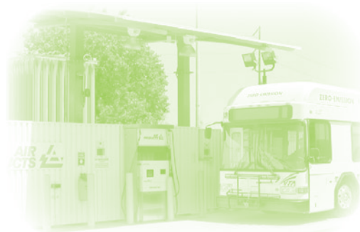
The Gillig buses in demonstration at VTA feature Ballard fuel cell systems.

THE GILLIG BUSES BEING TESTED by VTA/SamTrans are typical in every way—standard seating capacity, wheelchair lift, air conditioning—but they are fueled with hydrogen and propelled by a fuel cell electric drive. Ballard Power Systems supplies the two 150 kW (300 kW per bus) proton-exchange membrane (PEM) fuel cells, as well as one three-phase