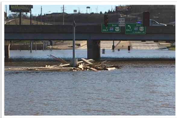
Meramec River flooding at I-44/Route 141

For more information, see the FIM Program Fact Sheet . In addition, a FIM Toolbox provides a set of criteria and guidance on how to develop a FIM in other parts of the country. There is also a more mobile friendly interface for the FIM Mapper Tool (Adobe Flash not required).