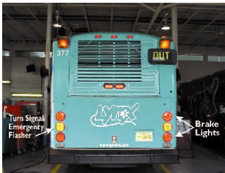
Figure 2 High Density Lights on the Back of a LYNX Bus

To assist with the evaluation of the effectiveness of this particular safety campaign, LYNX supplied CUTR with a database containing a total of 751 collision occurrence records. Unlike the HART database, LYNX did not include any non-collision occurrence data (e.g., slip-and-falls, etc.), and fewer variables were included for each record than was the case for the HART data. Each record provided the following variables: date and time of the crash, bus number, route number, location, descriptively-assessed (not actual) speed of the vehicles involved, identified preventability status, the type of involvement/impact dynamic (LYNX combines these into a single coding classification), and high density lights implementation status of the bus involved in the crash.