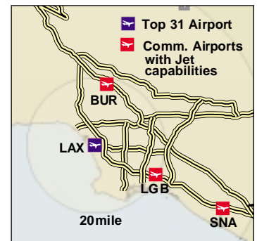
Los Angeles International Airport

“By organizing vast amounts of information into coherent pictures, geospatial data and GIS give us the power to discover emerging problems and devise solutions far more readily than with traditional analytical methods,” he added.