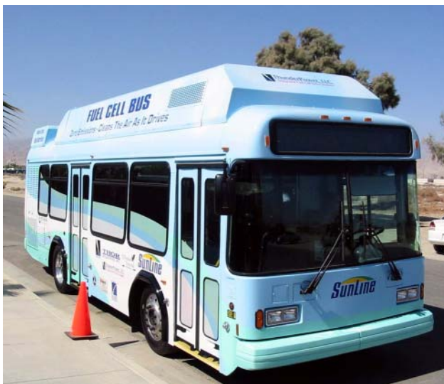
Figure 1. ThunderPower Fuel Cell Bus

Thor Industries and ISE Research developed and manufactured the 30-foot ThunderPower bus. It uses a compressed hydrogen proton exchange membrane (PEM) fuel cell power plant developed by UTC Fuel Cells in a hybrid configuration. The ThunderPower bus is one of a few fuel cell buses in the United States, and its use is a prelude to an upcoming demonstration program in California that will include seven more full-sized fuel cell buses. (Figure 1)