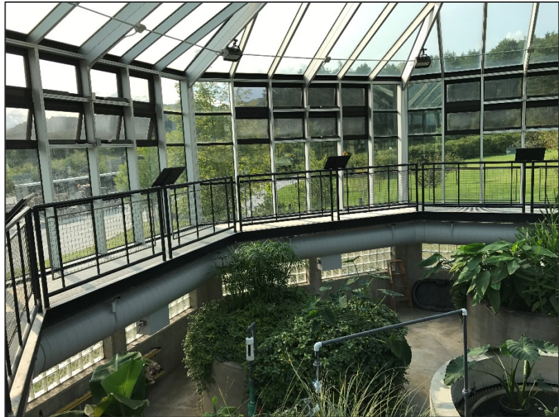
Figure 8: Interior of the Sharon Welcome Center's living machine, which treats wastewater for use flushing toilets at the welcome center, and includes educational signage for visitors.

Moving forward, BGS is considering how to make all of the State's buildings, including rest areas, net zero energy or nearly net zero energy. This could include offsetting building energy usage with renewable energy produced elsewhere in the State. The agency is also working with the Vermont Agency of Transportation on implementing electric vehicle chargers at strategic locations to reduce range anxiety, and implementing right-of-way solar projects.