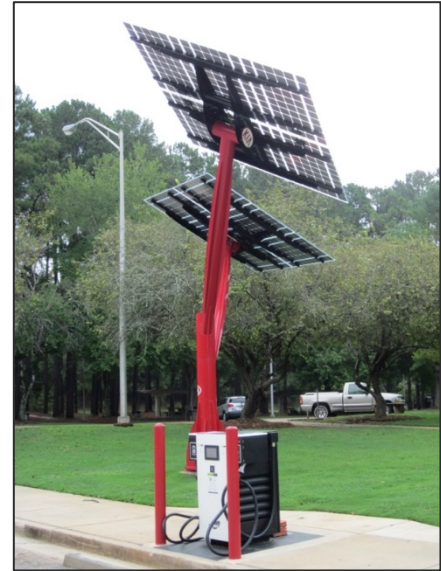
Figure 5: Solar-powered EV charging station at the I-85 Visitor Information Center in West Georgia.

Several of the innovations tested by the Ray are located at the I-85 Visitor Information Center just over the border from Alabama. This includes a PV-powered electric vehicle charging station, which makes an important link in the EV-charging infrastructure between Montgomery, AL and Atlanta, GA. The “PV4EV” charger offers free power to electric vehicles, and is paid for by The Ray (Figure 5).