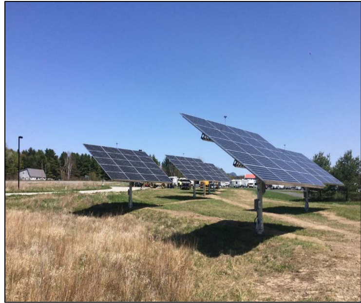
Figure 2: 75kW solar array at the Fair Haven Welcome Center in Vermont (Photo source: Vermont Agency of Transportation).

The electricity generated from solar panels can be used on-site to power the rest area or for hot water heating, or in some cases can be fed into the grid to help offset the DOT's electricity costs. Solar panels are modular and scalable, so they can be used in a variety of settings, from providing electricity to an entire building to powering specific applications such as outdoor lights, variable message signs, or electric vehicle charging stations.