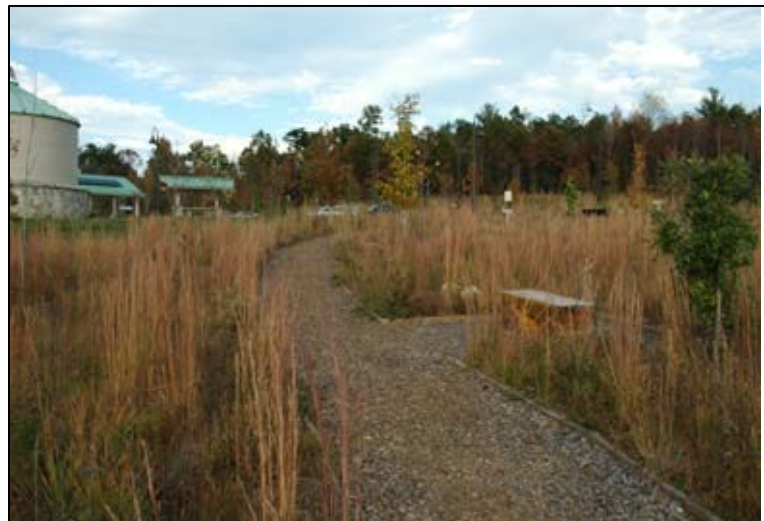
Figure 1: A trail around a rest area in Wilkes County, NC uses xeriscaping.

Xeriscaping, or using plants that require no or minimal water, reduces the water required for landscaping (Figure 1). Knowledge of the local climate and typical rainfall patterns will help rest area managers decide which plants can minimize water and maintenance needs. Inside rest area buildings, water conservation strategies include