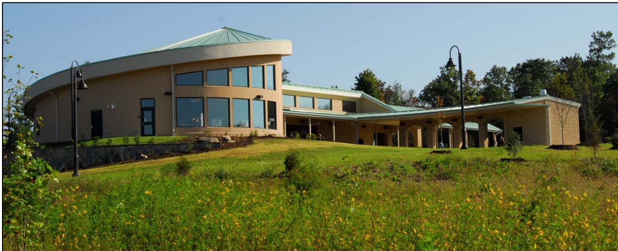
Figure 4: The rest area in Wilkes County, North Carolina is LEED Gold certified and opened in 2009.

The North Carolina Department of Transportation (NCDOT) incorporates sustainable practices in rest area construction and renovation projects when possible. Currently there are 61 rest areas in North Carolina: 41 Interstate rest areas and 20 rest areas along non-Interstate primary routes. Three rest areas in the state are LEED certified. The Wilkes County rest area (Figure 4) is along a primary route, US-421, and opened in October 2009 as LEED Gold Certified. A pair of north- and southbound rest areas located on I-73/74 in Randolph County opened in January 2010 as LEED Silver Certified. All three of these rest areas were new site construction.