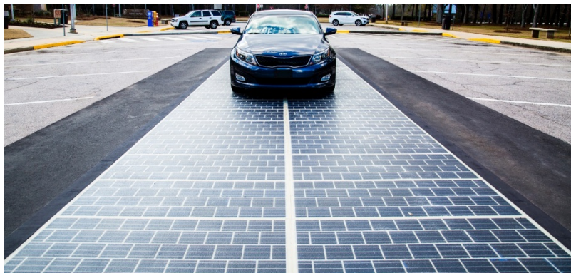
Figure 6: The Wattway solar roadway is located in the parking lot of the I-85 Visitor Information Center.

The Ray also developed the “Wattway,” a drivable solar road, at the rest area parking lot (Figure 6). The technology involves an application of solar cells over the existing roadway; the project at the I-85 rest area is the first deployment of this technology outside of France. The Ray collaborated with the GDOT on the project, who permitted the project through an encroachment permit. The energy generated by the solar road helps to power the visitor center building. A representative from The