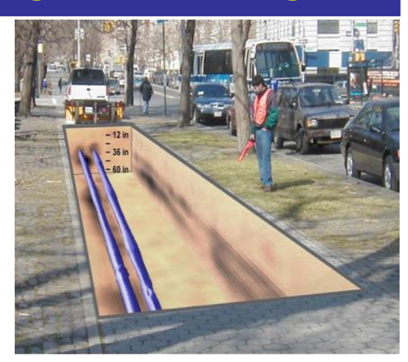
Computer-aided visualization of real data collected with ground penetrating radar.

The first quarter of the project produced very promising results. The research team built and