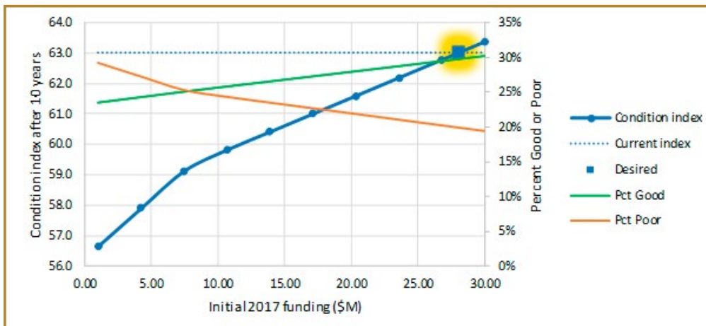
Figure 2: Network-Level RAMP Slope Condition Index versus Funding.

These recommendations, if undertaken, will help MDT improve the preliminary correlations, costs, and models developed in this research project at regular intervals. This will make the decision support tools more useful and budget-related planning more accurate, increasing Department benefit from the RAMP.