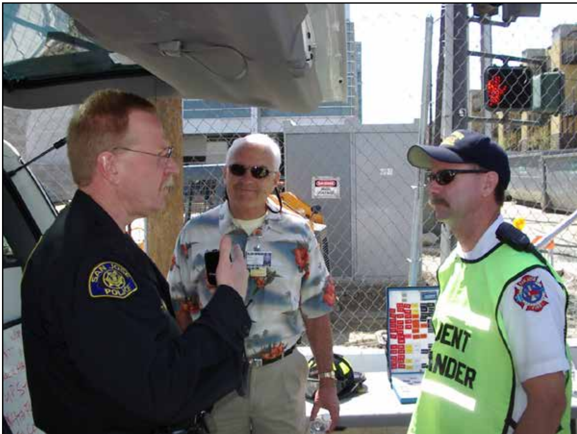
Figure 3. Evaluator Observes Command Post Interaction at Full Scale Exercise

In 2005 and 2009, Edwards and Goodrich served as exercise committee members and exercise evaluators for full scale exercises on the local railroad (scene shown in Figure 3). They were able to test a theory that, while full scale exercises often leave people confused about the right behavior in a disaster, the facilitated exercise was more successful with adult students who benefit from experiential learning and guided discussions. However, few transit and transportation personnel had the background in emergency management to develop meaningful scenarios on which to base the exercises, thereby limiting the value of the exercise. It seemed clear from Edwards' and Goodrich's practical research that a handbook was needed that would guide transportation and transit personnel in developing effective exercises for their agencies.