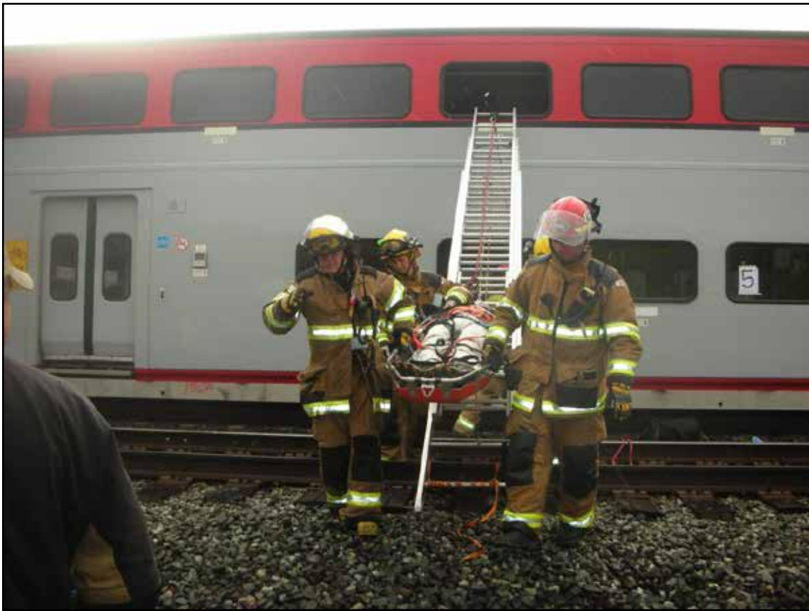
Figure 4. Rescue from Train at Full Scale Exercise