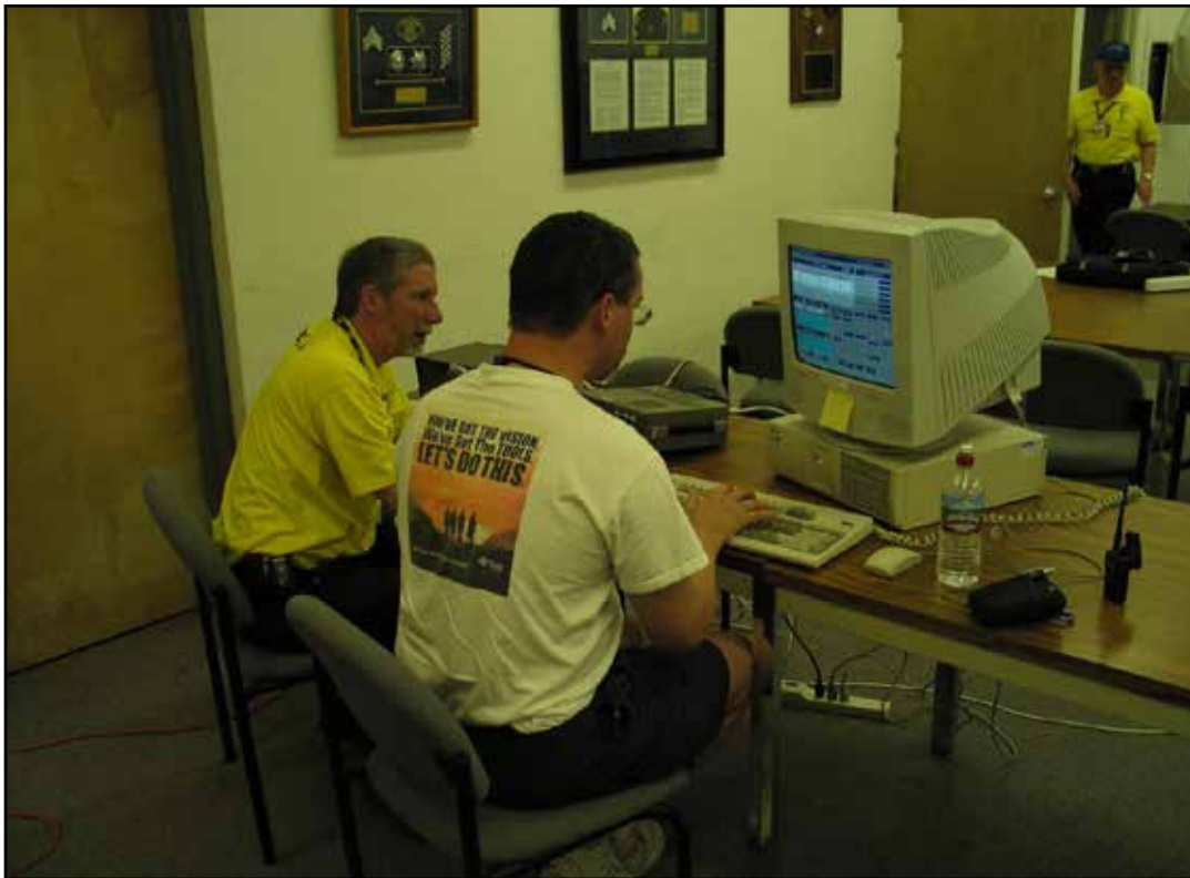
Figure 8. Simulators at Functional Exercise