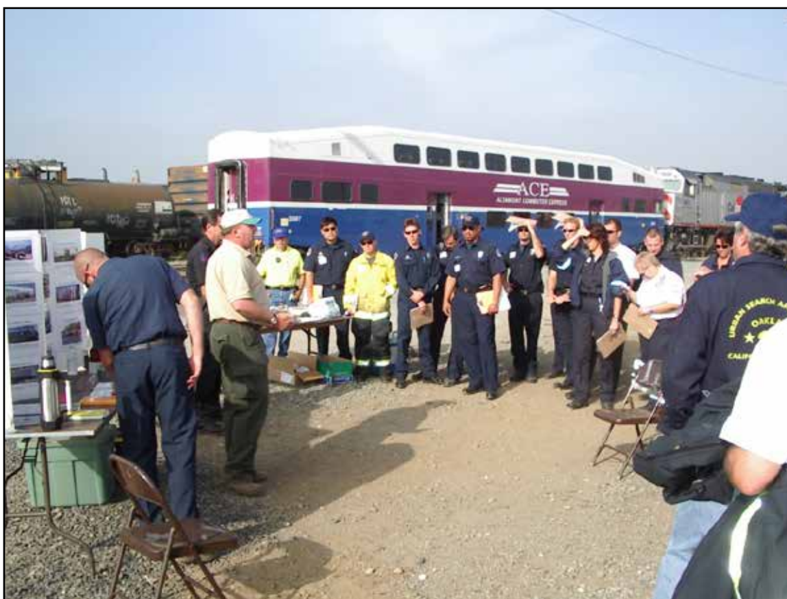
Figure 2. Learning Station at Facilitated Exercise, ACE

In 2002, Mineta Transportation Institute researchers began delivering emergency management training to the California Department of Transportation (Caltrans) headquarters and district staff members. Over 25 deliveries of transportation-customized class offerings, including 2.5-hour-long Incident Command System/ Standardized Emergency Management System/National Incident Management System (ICS/SEMS/NIMS) and 8-hour-long SEMS Emergency Operations Center, and Continuity of Operations courses, have resulted in knowledge about the methods used and the challenges faced in delivering emergency management training and exercises by the nation's largest transportation agency for its staff members. The MTI researchers have also worked with Valley Transit Agency (VTA) in Santa Clara County, Altamont Corridor Express Rail (ACE) (see Figure 2), Caltrain, and Amtrak on full scale exercises over the past 15 years. As a result of this exposure to the transit and transportation community, they became aware that training and exercise resources specifically developed for transportation and transit agencies are scarce.