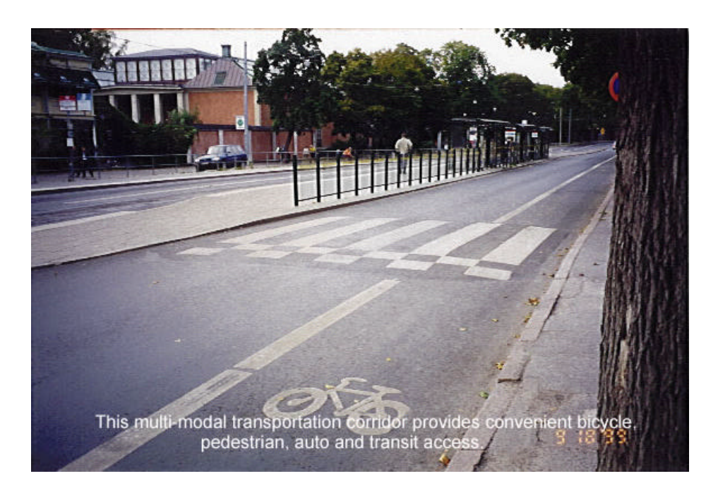
This multimodal transportation corridor provides convenient bicycle pedestrian, auto, and transit access.