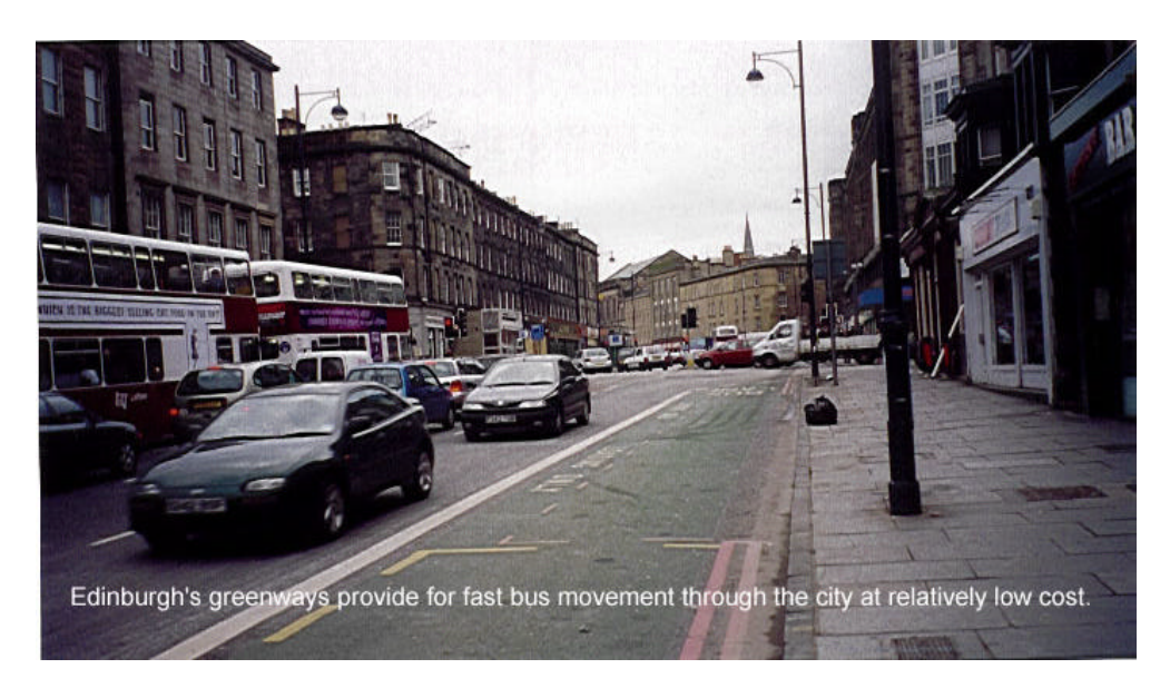
Edinburgh's "greenways" provide for fast bus movement through the city at relatively low cost.

Scottish officials reported that their main strategies for sustainable transportation emphasize coordinated transportation and land development at the local and regional levels, give priority to transit and nonmotorized modes of transport, and rely on public education to help residents make informed and sophisticated travel choices. In this approach, central city vitality is to be coupled with compact and contiguous suburban development, supporting a focus on exchange (or access) rather than movement. When motorized transportation is needed, the priority is to make public transport the preferred choice by making it competitive and attractive, and to encourage people to use cars thoughtfully and sparingly.