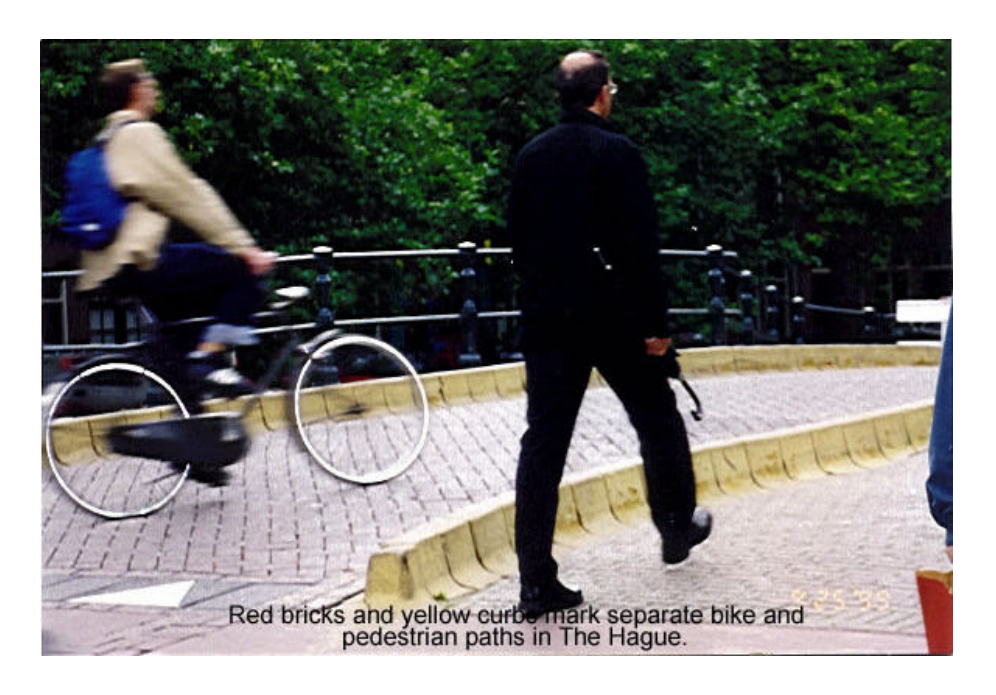
Red bricks and yellow curbs mark separate bike and pedestrian paths in The Hague.

Sophisticated designs are being implemented to provide greenways and green bridges in transport rights of way for animal crossings and habitat. In addition, the Dutch sometimes put highways, railroads, and parking underground, using air rights development as the financing tool, to reduce their impacts on the urban environment. Designs to capture and treat runoff and protect water quality are being implemented.