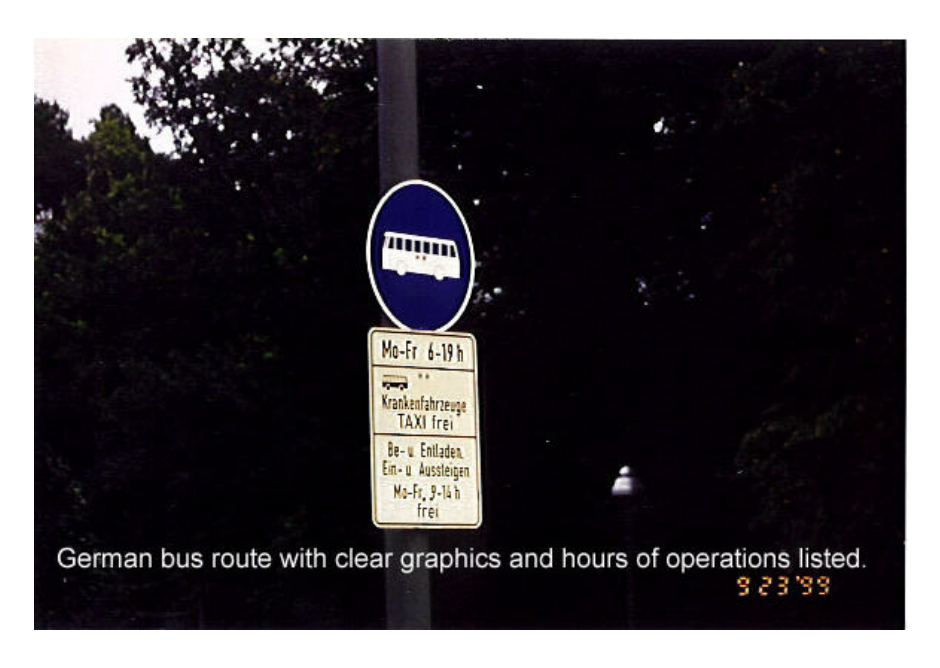
German bus route with clear graphics and hours of operations listed.

use plans and policies that reinforce existing centers and discourage or ban greenfield stand-alone malls.