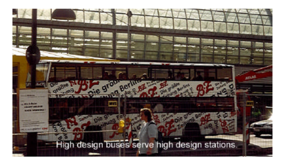
High design buses serve high design stations.

Urban policies are shaped by federal regulations on urban development that aim for compact growth, well matched to pedestrian, bike, and transit access. Under this policy, land development and transport improvements are to be matched to provide for cost-effective transportation and modal choices. Transit-friendly policies are emphasized, including dedicated bus lanes, good transit connections to major destinations such as airports and rail terminals, and bicycle facilities that are well connected to rail. Well-designed parking and transit facilities aim to enhance the urban streetscape and, in the case of transit, to make the transit rider's experience pleasant and convenient.