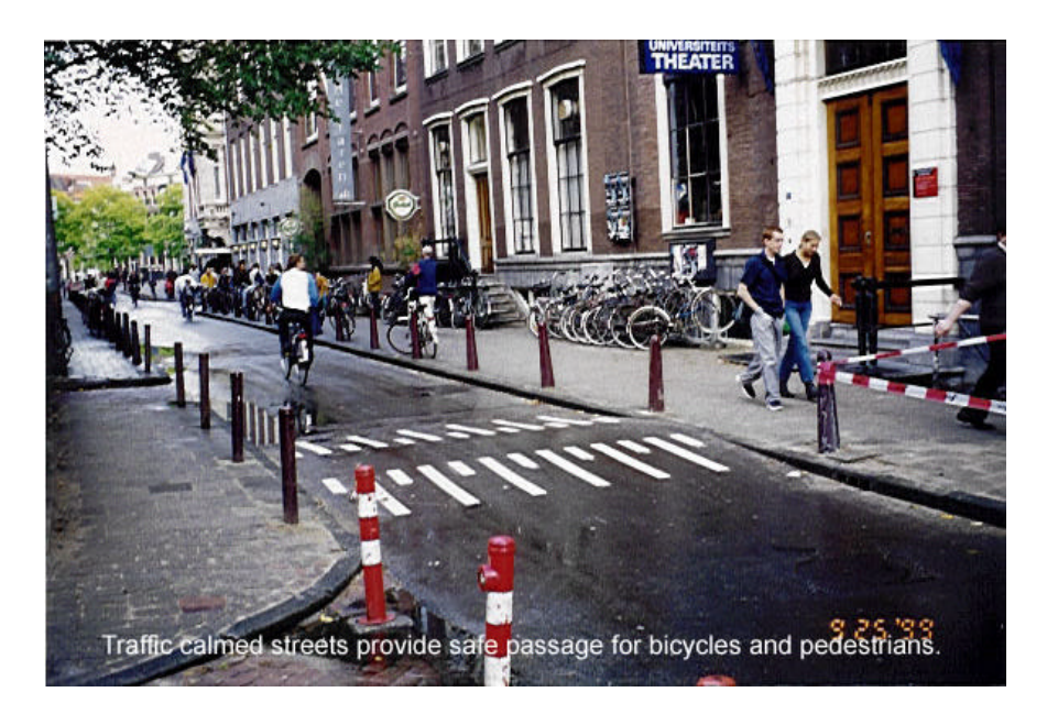
Traffic-calmed streets provide safe passage for bicycles and pedestrians.

and land-use policies. Incentives for using transit, biking, and walking are bolstered by high-quality infrastructure for these modes, along with widespread traffic calming.