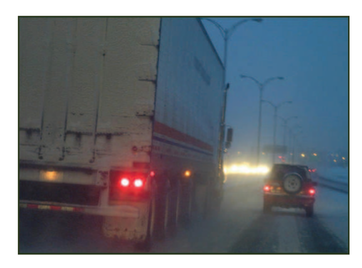
Freezing and thawing during winter months causes problems for roadway pavement that is exacerbated by semi-tractor trailers carrying heavy loads. That is why the SLR tool is valuable for state departments of transportation.