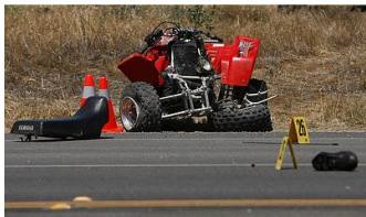
A high center of gravity, off-road vehicle tires and lack of a rear differential make ATVs and SxSs more dangerous to operate on the road than off. Roadway speeds further contribute to the risk of a crash.

fatalities occur on public roads. ATV crashes on the road also result in more serious injuries than those off the road. Knowledge about the risks involved is limited among riders and the general public.