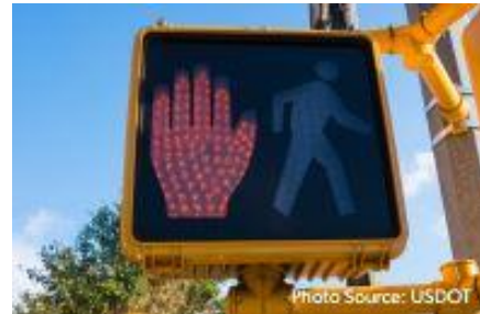
Figure 3: Crosswalk Signal

The Federal Transit Administration (FTA) developed V2P technology to reduce pedestrian incidents involving transit vehicles. The Pedestrian in Signalized Crosswalk Warning is an application that warns bus operators when pedestrians are in a signalized intersection or crosswalk and are in the path of the bus. The FTA has funded the deployment of the Enhanced Pedestrian in Cross Walk Warning (EPCW), the successor to Pedestrian in Signalized Crosswalk Warning. EPCW will be deployed at four crosswalks in Cleveland, OH, starting in 2017.