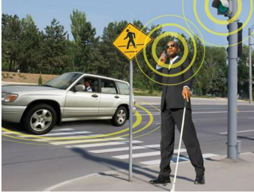
Figure 4: Connected Pedestrian

The ATTRI research program is seeking to fund the development of a safe intersection crossing application. The program currently has a Broad Agency Announcement for application development of several technology areas, including safe intersection crossing. Awards are expected in early 2017. The program envisions an application where pedestrians communicate with traffic signals and get automated intersection crossing assistance and vehicles receive alerts. The application is designed for people with vision, cognitive, and mobility issues.