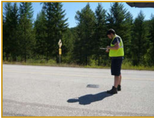
Figure 1: On-site Collection of Operating Speed Data

The literature review revealed that little published information exists on the practice of setting posted speed limits lower than engineering recommended values. The survey was sent to all state transportation agencies with representation on the AASHTO Subcommittee on Traffic Engineering, which included a total of 71 representatives from 51 states or territories. Twenty-two of the 28 responding agencies indicated that they engaged in the practice of setting speed limits lower than engineering recommendations.