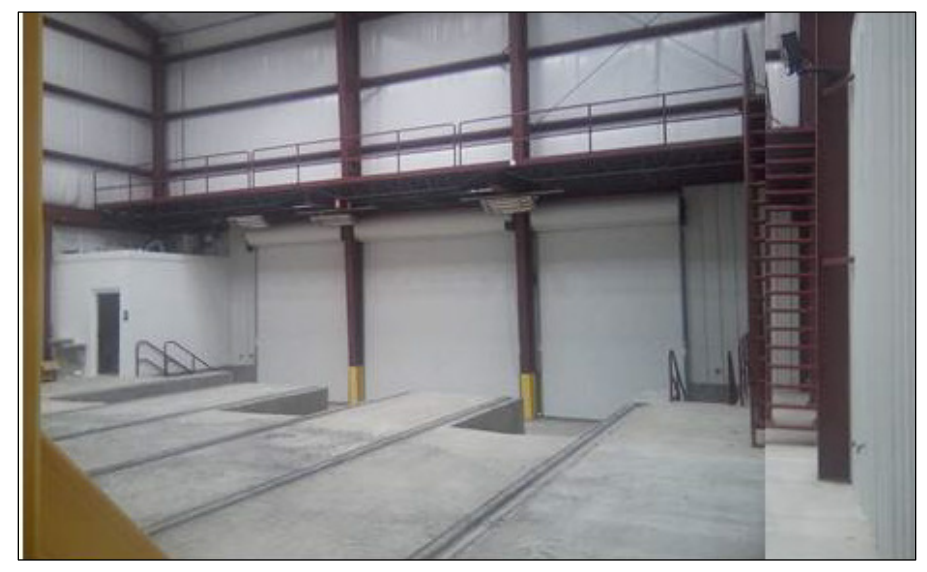
Figure 3. Mezzanine Level for Viewing.

A covered soil storage building was constructed to reduce the impact of weather on the moisture content of soils used for testing. This steel building provides a covered area for materials and allows for sediment bed preparation during inclement weather (see Figure 5).