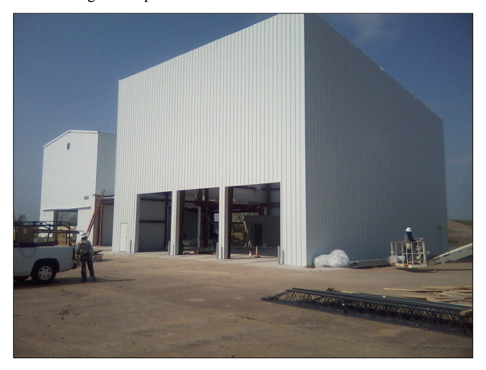
Figure 2. New Indoor Rainfall Simulator Building.

The building has six 14-ft. × 14-ft. roll-up doors: three at the building front to accommodate placement of the soil-fill test beds and three located at the rear of the building for retrieval of sediment collection system from the ramp entry at that the rear location. The rainfall simulator system consists of three independently operated rainfall racks that rise to accommodate any slope condition to maintain a 14-ft. above-bed height to ensure that the large raindrop distribution (approximately 4–6 mm) reaches 90 percent terminal velocity. Each rainfall simulator system has a motor that moves the racks to produce a random raindrop pattern to further simulate a natural, severe rainfall event. The rainfall simulators provide water drop size distribution and impact velocity that are typical of storms common to Texas and the Gulf Coast regions of the country. The rainfall simulators are designed to subject test beds to the greatest, most destructive rainfall characteristics and can generate up to 8 inches of rainfall per hour. In addition, the expansion facility design enables new performance evaluation capabilities for ASTM D6459-11 Standard Test Method for Determination of Rolled Erosion Control Product (RECP) Performance in Protecting Hillslopes from Rainfall-Induced Erosion.