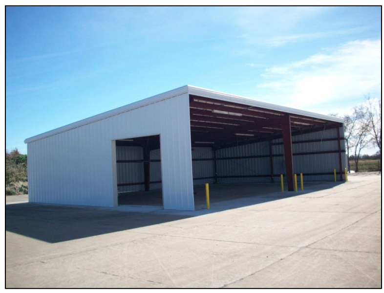
Figure 4. Soil Storage Building.

The relocation of the SRD flume was necessary to enable the construction of the new rainfall simulator. Demolition of the existing SRD flume occurred along with building/preparation area construction. The new SRD flume was relocated adjacent to the 2,800 sq. ft. climate-controlled greenhouse.