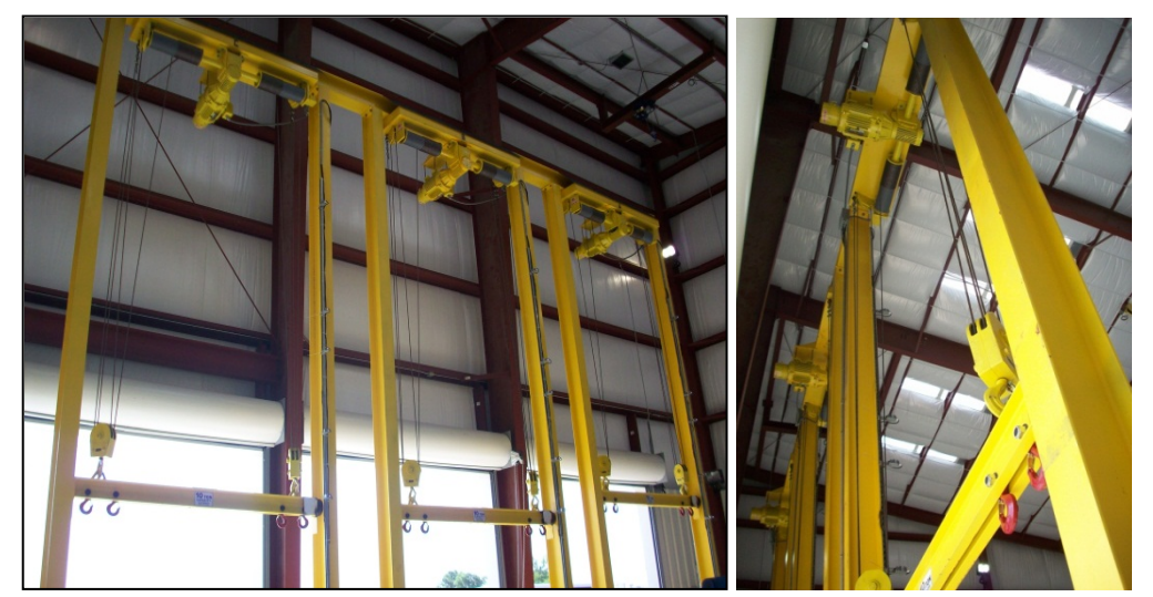
Figure 2. The 10-Ton Hoist System for Soil-Fill Test Beds.

A 1,500 sq. ft. covered preparation area connects the existing simulator and the new building. This area provides a covered space for preparation, storage, and connectivity. It also contains a fire suppression system.