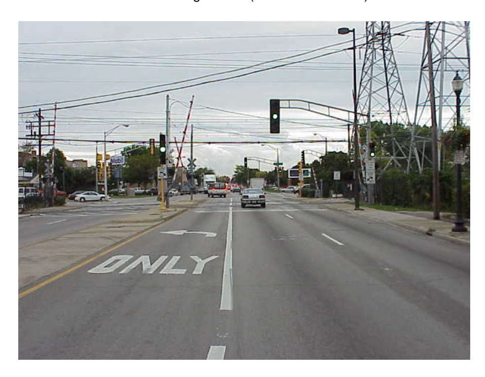
Figure 8 - Oakton Street crossing (street view)