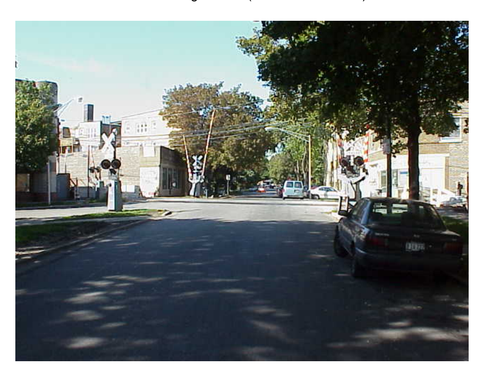
Figure 14 - Manor Avenue crossing (street view)