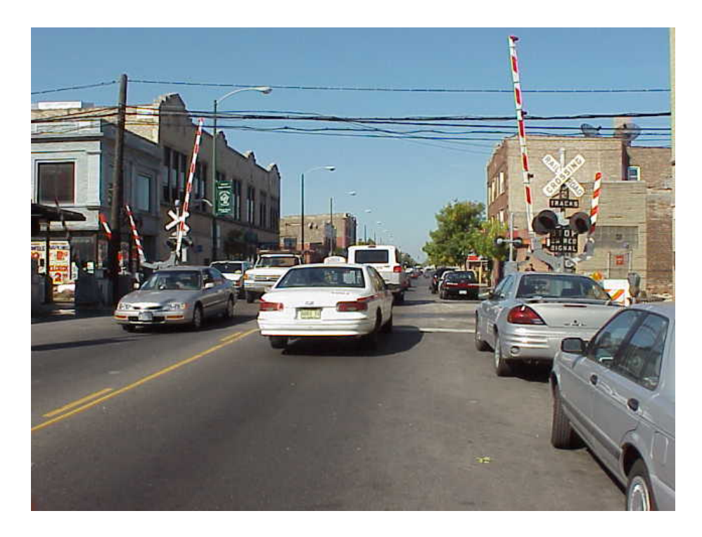
Figure 12 - Kedzie Avenue crossing (street view)