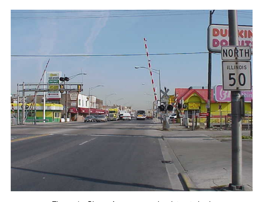
Figure 4 - Cicero Avenue crossing (street view)