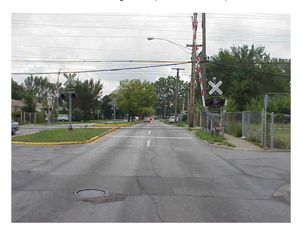
Figure 10 - Crawford Avenue crossing (street view)