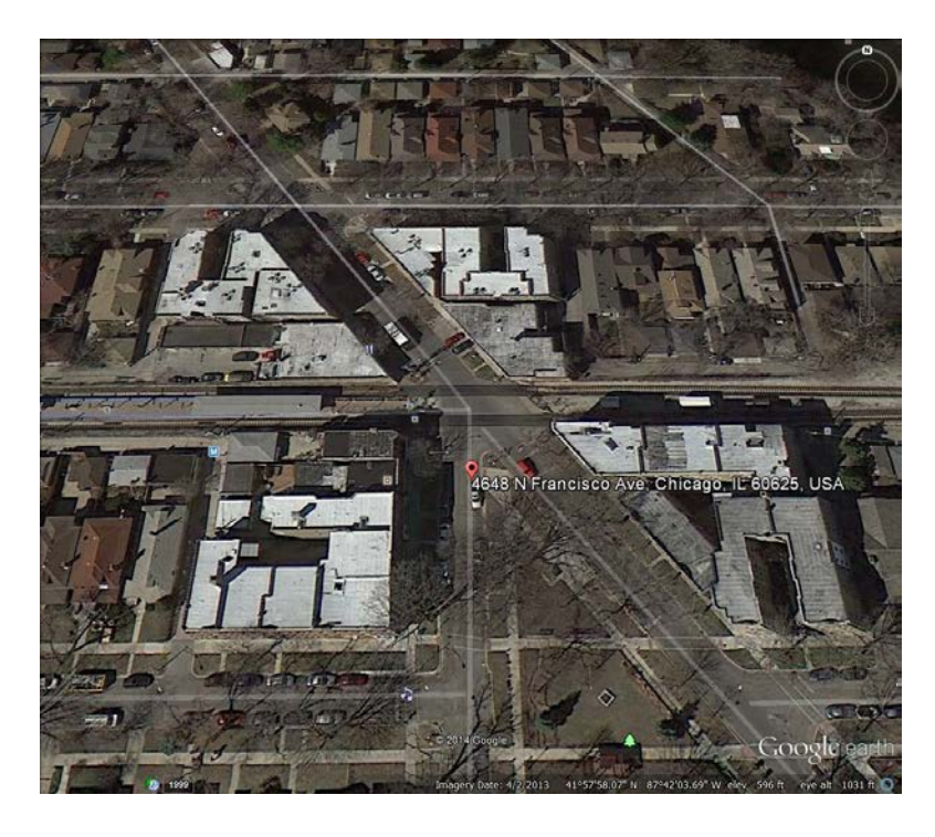
Figure 13 - Manor Avenue crossing (view from above)