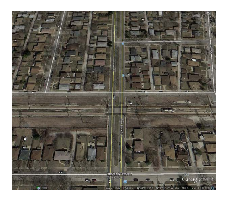
Figure 9 - Crawford Avenue crossing (view from above)