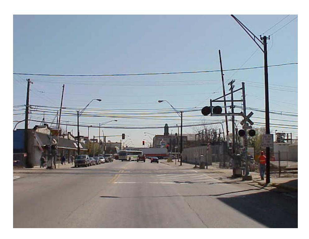
Figure 2 - Laramie Avenue crossing (street view)