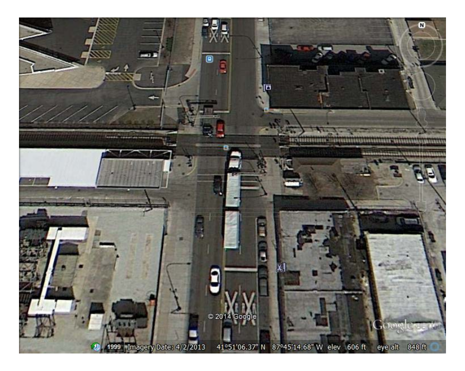
Figure 1 - Laramie Avenue crossing (view from above)