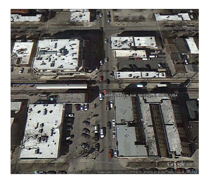
Figure 11 - Kedzie Avenue crossing (view from above)