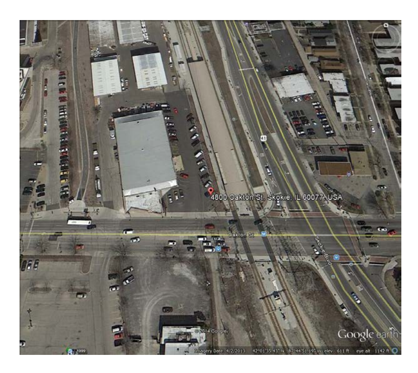
Figure 7 - Oakton Street crossing (view from above)