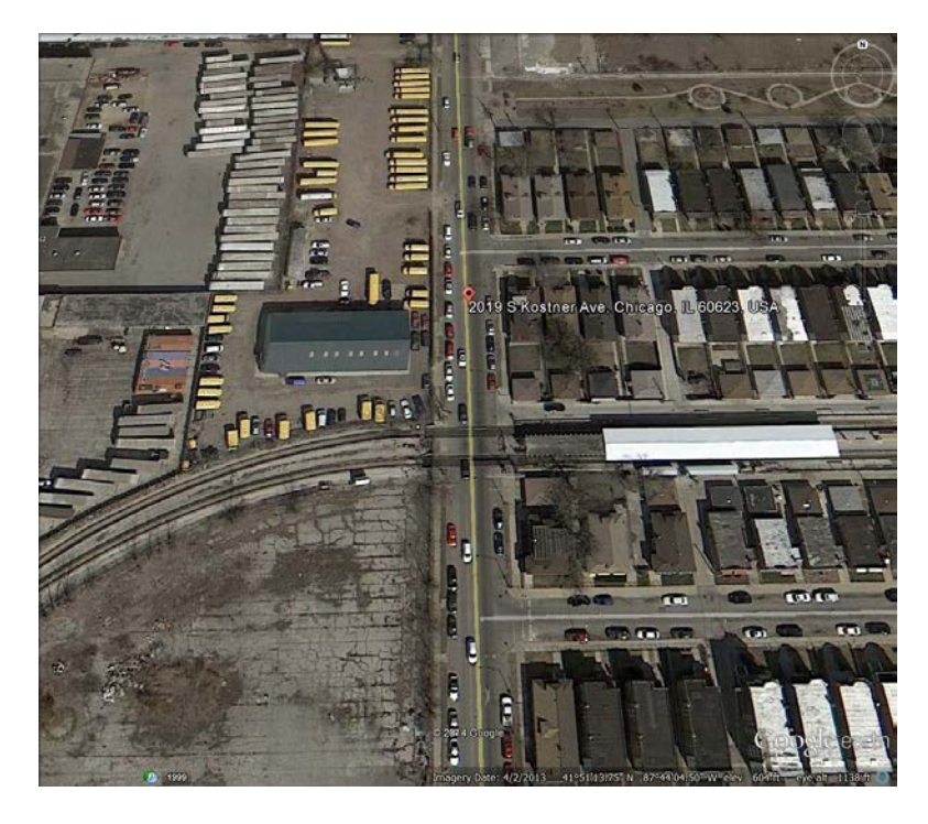
Figure 5 - Kostner Avenue crossing (view from above)