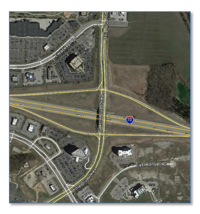
Example of Signalized Diamond Interchange Site (D4SG4) with Calibration Values of 0.853 for Fatal+Injury (FI) Crashes and 1.830 for Property-Damage-Only (PDO) Crashes

The project calibrated various Missouri freeway interchange facilities, including diamond, partial cloverleaf, and full cloverleaf interchange terminals, and ramps and speed-change lanes. Missouri interchanges can now be modeled using the HSM.