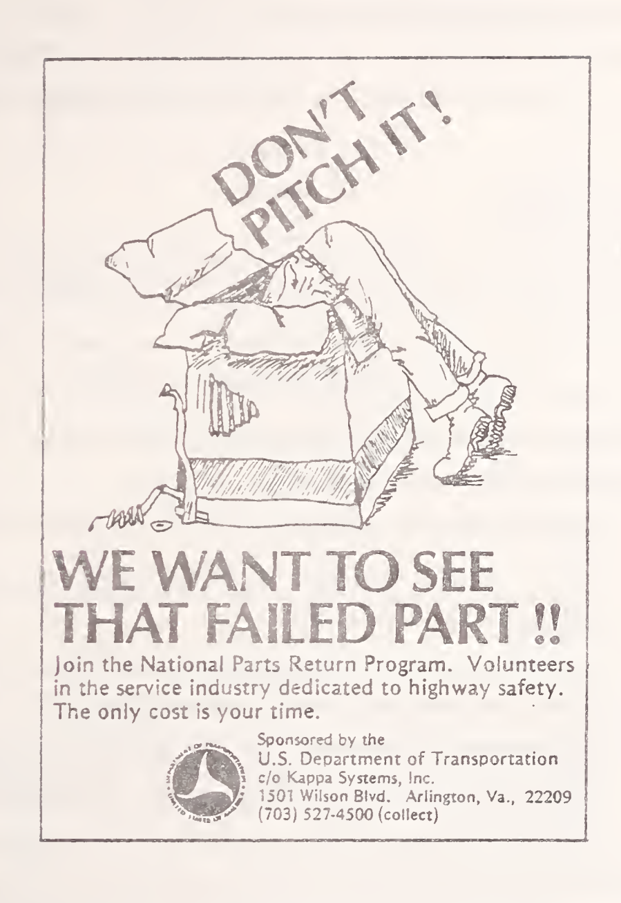
Figure 1: Motor Magazine Advertisement