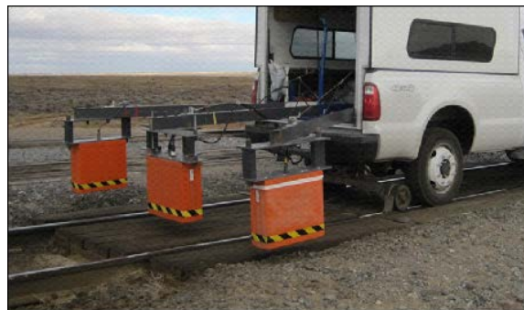
Figure 1. GPR antennas mounted to a hi-rail vehicle

Figure 1 shows a typical hi-rail-based GPR system, and Figure 2 shows a radar image of the subsurface profile produced by recorded GPR data.