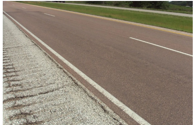
Moisture-related distresses on HMA over JPCP-type composite pavement system where no drainage outlets located in the field