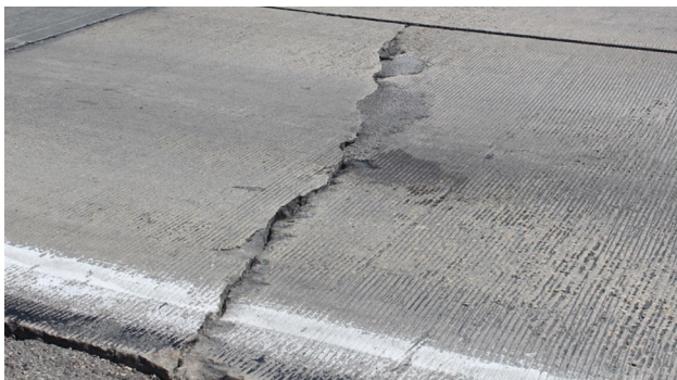
Moisture-related distresses on JPCP where no drainage outlets located at site