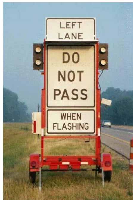
Bushman and Klashinsky 2004

A system used by the Indiana DOT (INDOT) uses detectors to determine when a queue is present in the open lane and activate Do Not Pass signs. The signs are placed adjacent to the closed lane at quarter- and half-mile intervals for 2.5 miles upstream of the lane closure (McCoy and Pesti 2013). This encourages drivers to merge into the open lane before reaching the end of queue and prohibits them from using the closing lane to pass vehicles queued in the open lane (Pesti et al. 2008). Some of the equipment for an early-merge system is shown in Figure 8.