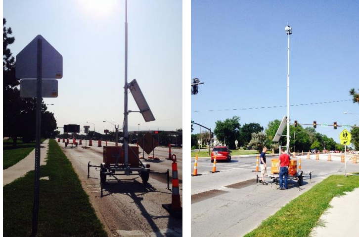
Figure 11. Placement of the camera at the work zone

The urban arterial work-zone camera captured vehicles as they moved into the single lane in the left turn lane as seen in Figure 12.