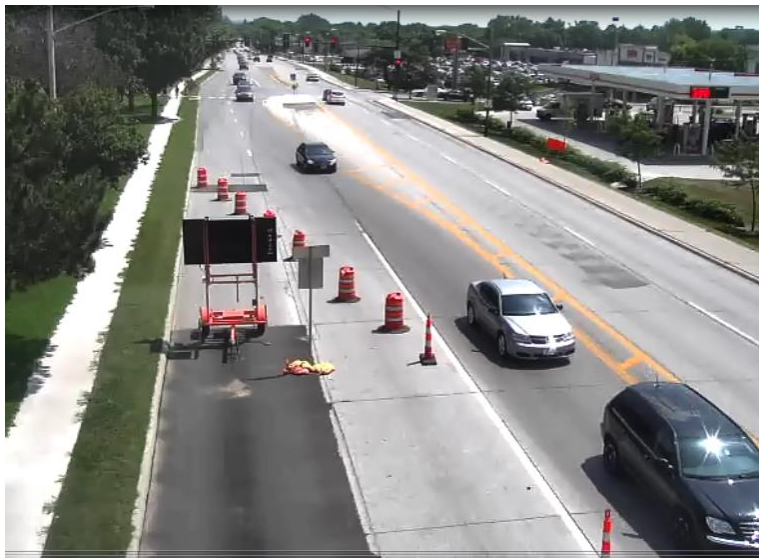
Figure 12. Camera view of drivers merging in work zone

The urban arterial work-zone camera captured vehicles as they moved into the single lane in the left turn lane as seen in Figure 12.