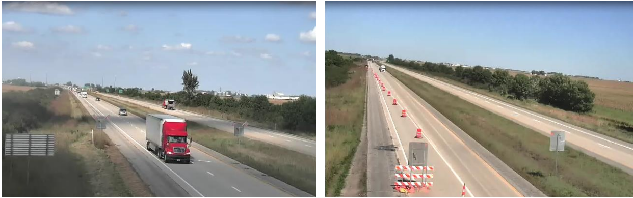
Figure 13. Views from upstream (left) and merge (right) cameras on I-35

Data were reduced for the hour by manually coding the videos at both the upstream and merge point. At the upstream location for the hour of interest, the number of heavy vehicles and all other vehicles in each lane (left and right) were counted. At the merge point, the number of heavy vehicles and all other vehicles were counted as well as the number of vehicles merging right before the start of the taper. Figure 13 demonstrates the views available from each camera.