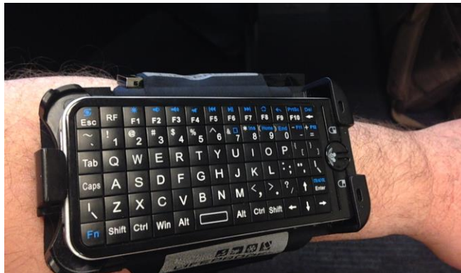
Figure 3. Arm-mounted wireless mini keyboard for dynamic simulation control

These and other terrain features can be modified real-time, in situ, through an arm-mounted wireless keyboard (see Figure 3).