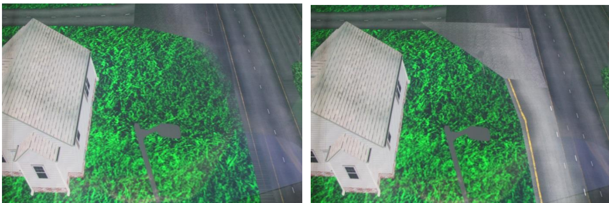
Figure 2. Simulator view of intersection with narrow merging lane (left) and a wide merging lane (right)

The image on the left presents one side of a road around a TWSC intersection on a flat terrain, while the image on the right presents the same road, but on a hilly terrain. Similarly, Figure 2 shows a bird's eye view of an intersection with a narrow and a wide merging lane.