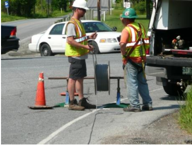
Figure 9: Measuring wire.