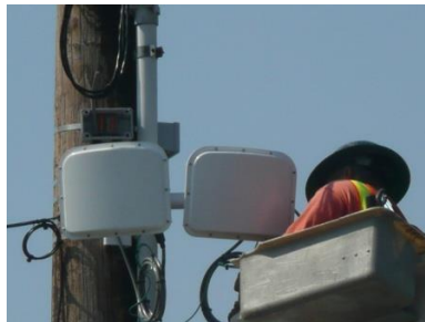
Figure 7: Positioning sensor.