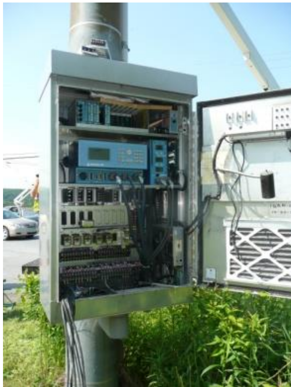
Figure 3: Control box.

The brackets to attach the sensors were mounted on the utility poles. Each bracket was mounted at least 17 feet up the pole to avoid the power lines in place. Two brackets were mounted to each pole and were secured by two metal bands, one tightened on the bottom and one on the top. Two electrical boxes were mounted next, one over each bracket. These were also secured with metal bands. The brackets and electrical boxes are shown in Figure 4 and Figure 5 below.