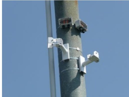
Figure 5: Mounting brackets and electrical boxes.

The sensors were then anchored on each mount. Each sensor is responsible for regulating a lane so they must be properly positioned to the correct lane. This is shown in Figure 6, Figure 7 and Figure 8.