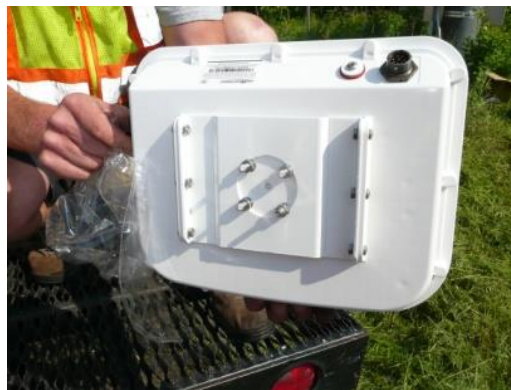
Figure 2: Pole facing side of sensor.