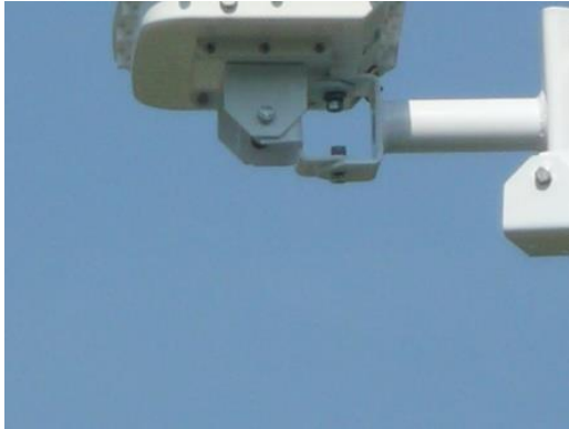
Figure 4: Mounting brackets.