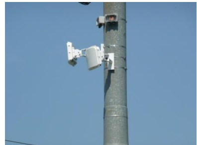
Figure 8: Sensors after positioning.