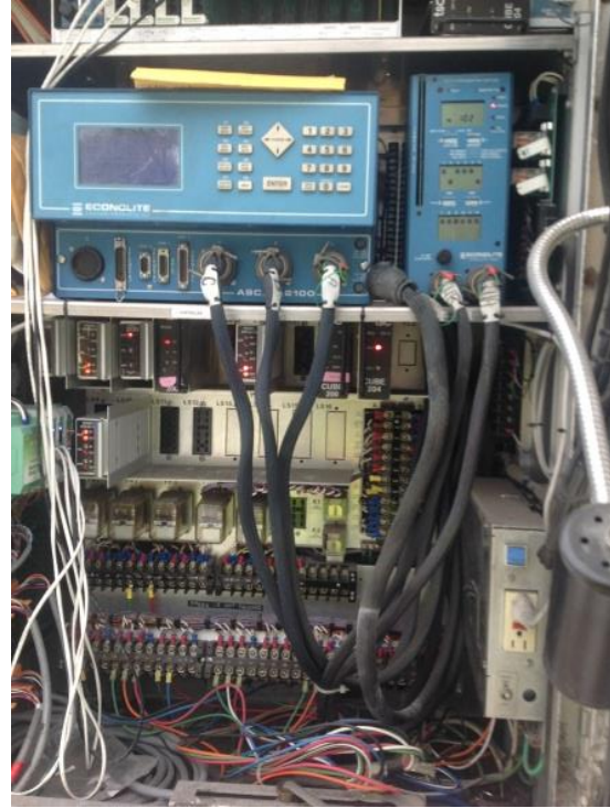
Figure 15: Inside of the control box.

For the purpose of this analysis, VTrans 2000-2014 crash data was utilized to perform a cross sectional analysis of the VT 116 and Shelburne Falls Road/CVU Road intersection prior to and following the installation of the Wavetronix® Smart Sensor Matrix™. Various potential explanatory variables for each crash including weather conditions, time of day, time of year, type of crash, and reason for each crash was examined to determine any changes in the number of crashes, injuries and fatalities before and after the Wavetronix® system installation.