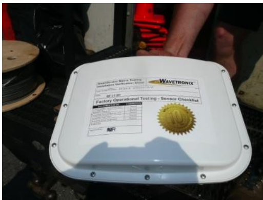
Figure 1: Traffic facing side of sensor.

According to product literature, the SmartSensor Matrix™ system is comprised of four radar detection units. Ideally they would be installed in two corners of an intersection to allow for 90° field of view so that when vehicles enter the user-defined zones the controller will detect their presence. Each detection box measures 13.2 in. x 10.6 in. x 3.3 in., weighs 4.2 lbs, and is resistant to corrosion, fungus, moisture deterioration, and ultraviolet rays. Based on manufacturing techniques, the system is considered to be extremely low maintenance. Battery replacement, recalibration, cleaning, and readjustments are not necessary. The purpose of the system is to detect vehicles and extend the green light if the system detects the speed at which a vehicle is travelling would cause a conflict if they were to stop abruptly. This overhead system is also not susceptible to damage induced by frost heaves, rutting, and other pavement structure deformations as is the case for standard loop detection systems (4). The device is shown in Figure 1 and Figure 2 below.