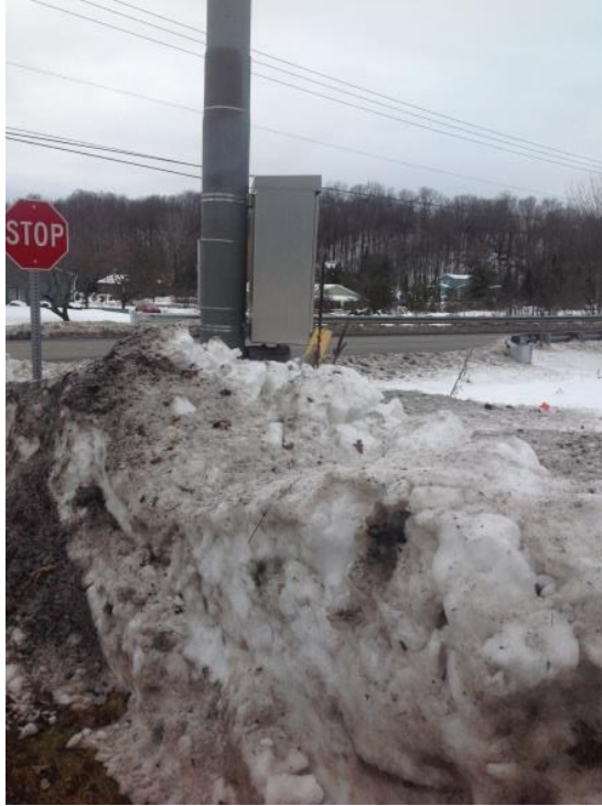
Figure 14: Control box in the winter.