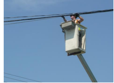
Figure 11: Running the wire across intersection.