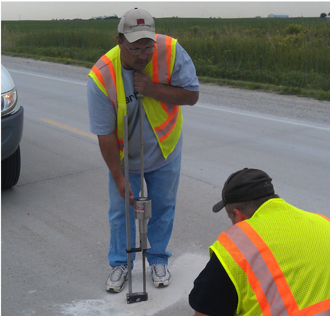
Figure 2. Dynamic cone penetrometer testing