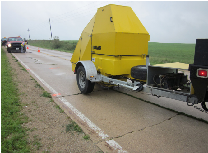
Figure 1. Falling weight deflectometer testing