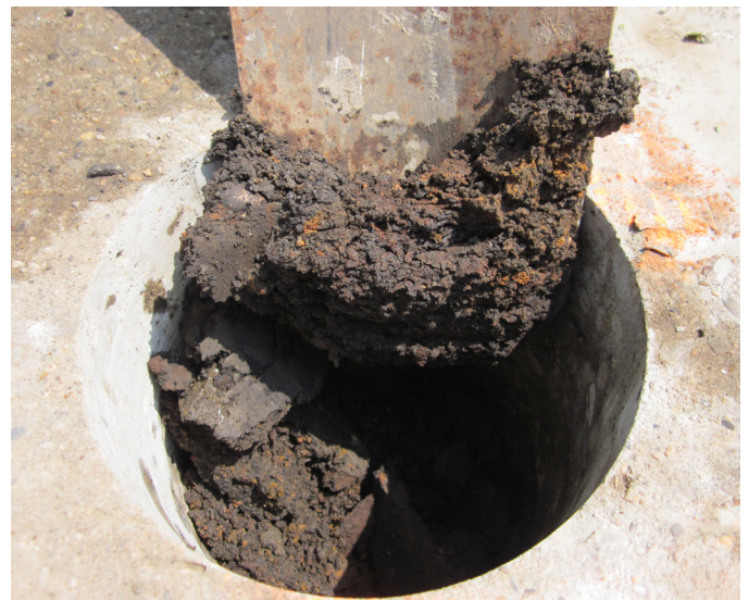
Figure 4. Excavation of subgrade soil

Previous research indicated that uniformity of pavement support conditions plays a critical role in long-term performance of PCC pavements. Uniformity of pavement support conditions was also evaluated in this study based on FWD test results. A uniformity classification matrix was developed to compare results from each site.