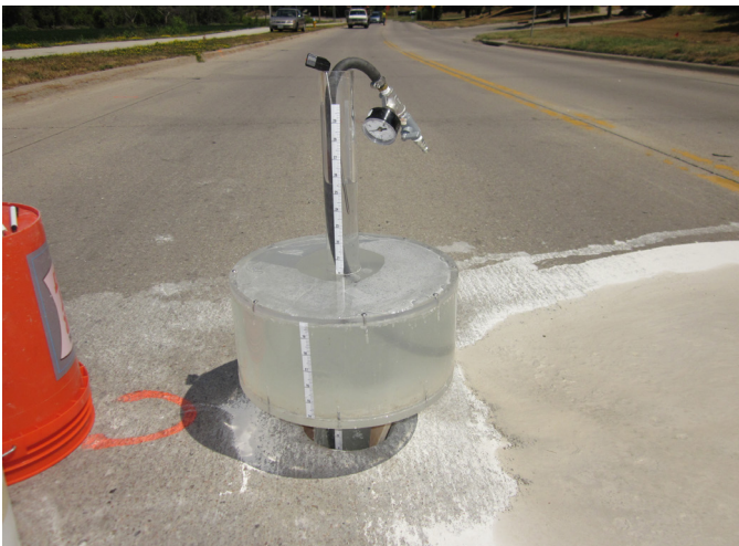
Figure 3. Core hole permeameter testing

permeameter (CHP) test device (Figure 3). FWD tests provided a measure of subgrade k values (hereafter, referred to as k_{\text{FWD}} ). The k_{\text{FWD}} values determined from this study were corrected for slab size and dynamic effects and reported as Static k_{\text{FWD-Corr}} values. DCP tests were used to empirically estimate the modulus of subgrade and subbase layers, and then graphically determine the composite modulus of subgrade reaction k_{\text{comp}} values (hereafter, referred to as k_{\text{comp-DCP}} ), per AASHTO (1993) guidelines. k_{\text{comp}} values were also determined from Static k_{\text{FWD-Corr}} values using subbase layer modulus estimated from DCP tests and the AASHTO (1993) graphical procedure and are reported as Static k_{\text{comp-FWD-Corr}} . Loss of support under pavements was evaluated based on FWD testing using the concept of zero load intercept, and also by comparing the k_{\text{comp}} values determined from FWD and DCP tests. It is assumed that existing under pavements at the time of testing, but the DCP tests do not because only properties of individual layers are used in the calculation.