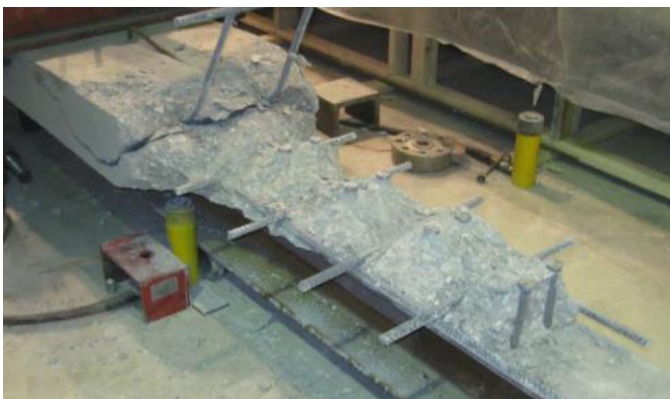
Second peeling test (2 shear studs) (Dahlberg 2014)

These methods have not been widely or often used to remove bridge decks, but were thought to have the potential to change and have a positive impact on the state-of-the-practice for bridge deck removal.