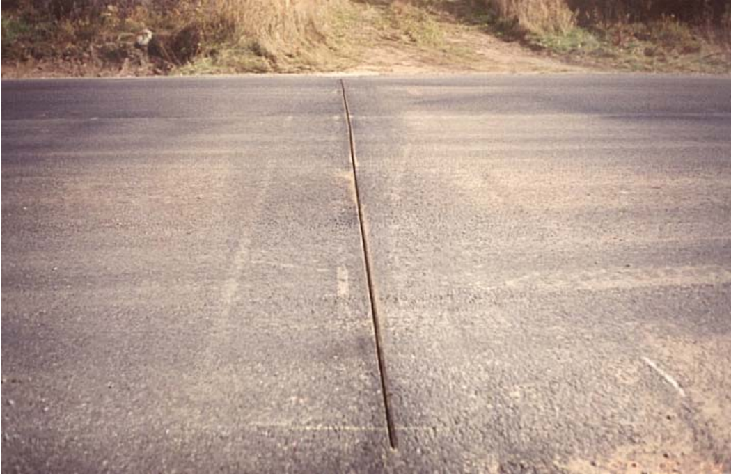
Finished Joint - Previous to Sealing