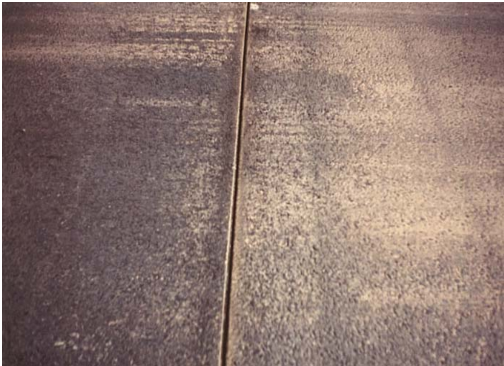
Finished Joint - Previous to Sealing