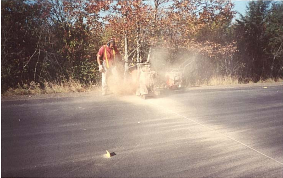
Joint Sawing - First Pass