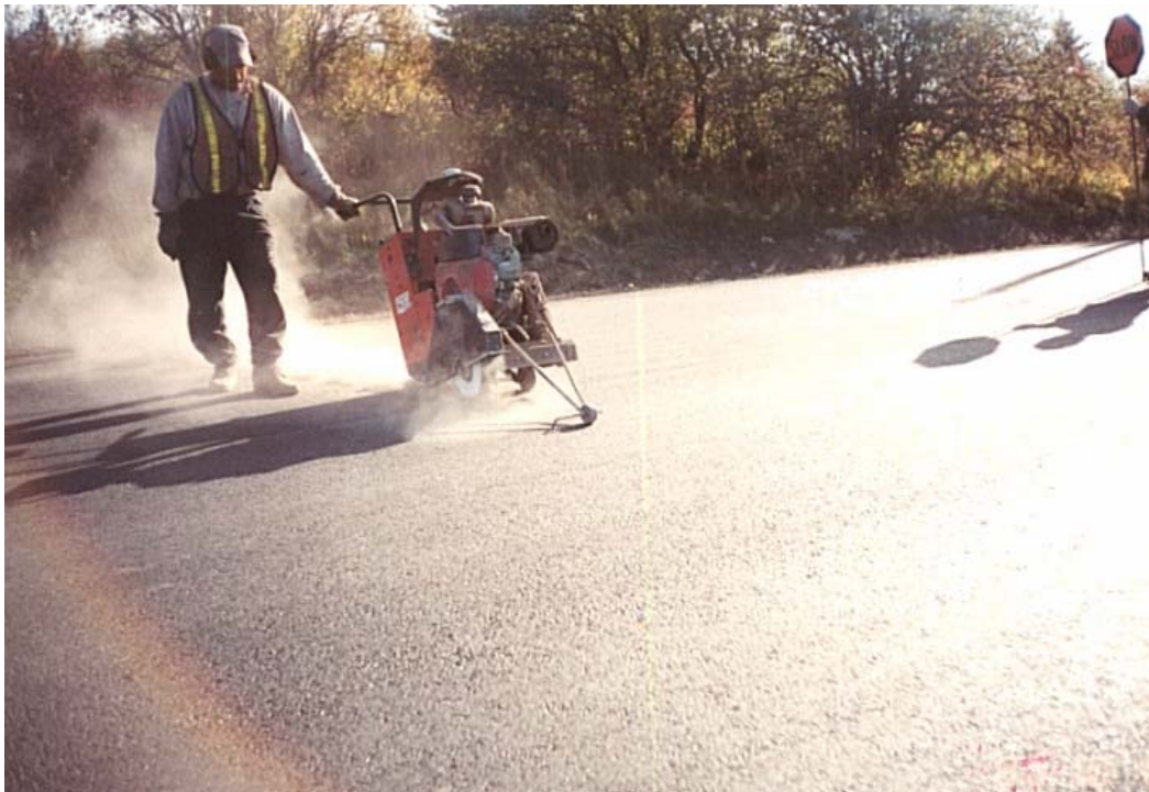
Joint Sawing - Second Pass