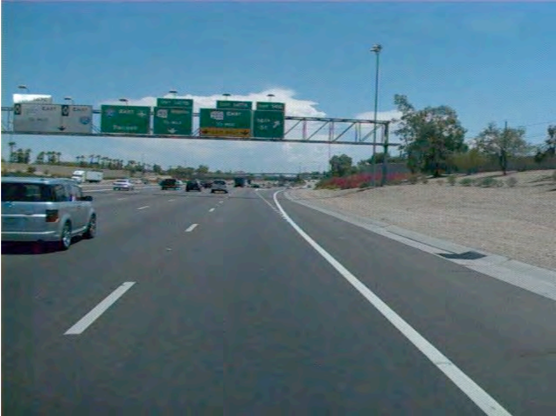
The sign in yellow is “Exit Only.” Auxiliary-lane striping begins at the point of this sign.