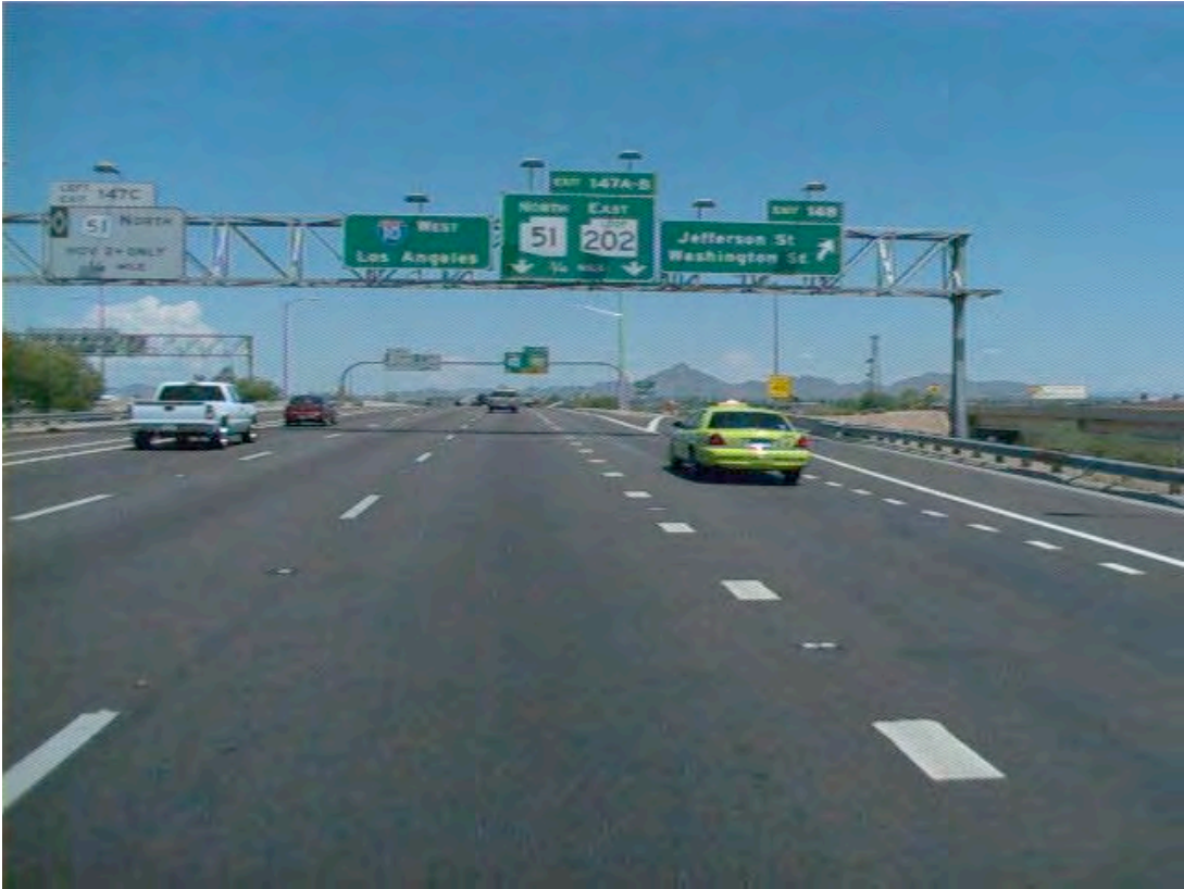
I-10 West showing larger route shields for Interchange routes.