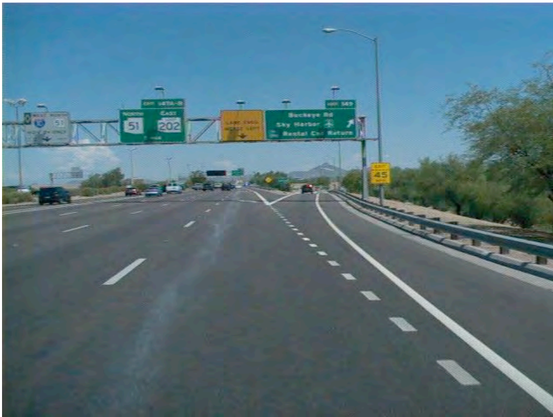
This a sign with the larger route shields and legends as proposed in the new MUTCD.