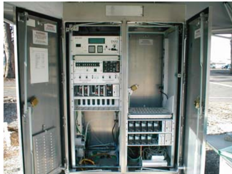
ITS 340 Cabinet with 2070 Controller