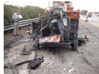
Kettle Hit Picture in District 10

The Caltrans Maintenance crew in District 6 developed a new LCSM2 operational procedure to extend seal distance with the now limited two kettle contents limitation. After the double kettle trailer was emptied on the highway, the crew had a third hot kettle waiting off the highway in reserve. This standard issue kettle was then towed out on the highway and the hot sealant was then pumped into one of the double trailer tanks. This approach increased the two kettle capacity to three and thereby extended the highway sealing distance of the LCSM2. This hot sealant transfer approach fit into Caltrans safety procedures and eliminated the problem of wait times on the highway as the kettles were recovered with block sealant. Since standard kettles are designed for hand application, the