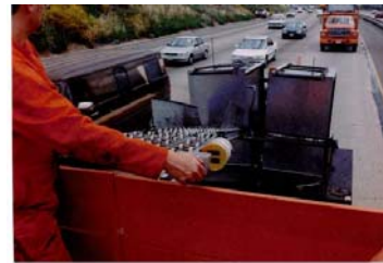
LCSM Loading Ramp