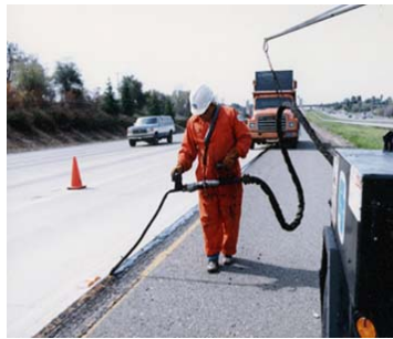
Longitudinal Sealing by Hand

The goal of the Transfer Tank Longitudinal Sealer (TTLS) project was to develop the next generation machine in a line of the Longitudinal Crack Sealing Machines (LCSM) developed by the Advanced Highway Maintenance and Construction Technology Research Center (AHMCT) and the California Department of Transportation (Caltrans) Division of Equipment, deployed through Caltrans Division of Maintenance, and operated on California Highways. The new machine would both build on the successes of the previous LCSM machines and further extend system capabilities in order to realize the full potential of this type of equipment to decrease costs, increase production and improve the safety of crack sealing operations. The project deliverable was a fully functional high production crack sealing machine capable of being