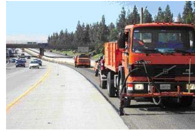
LCSM2 in District

into the back of the truck body. The other end of the ramp ended at each of the loading hatches in a stepped fashion creating a path to each of the four openings. A sealant block was sent to a certain opening depending on which of the four parallel belts it was placed on the truck end of the ramp. Hatch covers were developed with flapper lids that allowed for the dropped sealant block to push