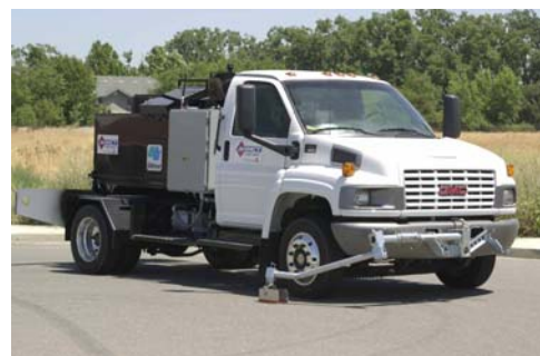
TTLS Application Truck

The TTLS application truck is a fully self-contained longitudinal sealing machine capable of heating and applying hot applied polymer modified sealants on the highway. The truck chassis has dual steering, controls and indicators to enable the driver/operator to conduct longitudinal sealing operations off either side of the vehicle with a minimal configuration change. A single operator/driver can control the entire machine from inside the truck cab without having to step out onto the highway. A multi colored touch screen user panel inside the cab provides for control and monitoring of all components necessary to operate the sealer. The system is Programmable Logic Controller (PLC) controlled with a user program that automates machine set-up and simplifies operation. The TTLS truck carries a 400-gallon hot applied crack sealant kettle with a single propane burner. The tank is mounted to the truck with a load-sensing mount that allows the sealant level to be monitored on the user panel. A 25-