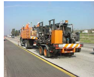
LCSM2 Double Trailer

The primary goal of the development of a second generation longitudinal crack sealing machine (LCSM2) was to mitigate the hot sealant supply shortage issue. A simple line of reasoning emerged that guided the redesign effort. Since in general terms the existing LCSM spends half of the time on the highway idle waiting for the kettle to recover, doubling the number of kettles used in the operation should provide for nearly continuous operation. The operational concept of the new machine would remain the same as the original sealing machine, the major difference would be that two kettles would be used instead of one. Doubling the size of a single kettle may have had the same effect, with half as much hardware, but since Caltrans already had two kettles and a large trailer on hand, the double kettle approach was undeniable. The LCSM that was successfully deployed and in operation in District 11 was removed from service so the dual steer truck and kettle could be modified into the LCSM2.