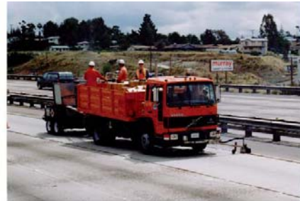
LCSM in District 11

The first Longitudinal Crack Sealing Machine (LCSM) built by AHMCT consisted of a modified 350-gallon Bearcat sealant kettle trailer. The initial design did not have a dedicated truck to pull the trailer, but instead was designed to be quickly installed onto any available generic Caltrans stake side truck. To install the system, a simple applicator bar was clamped on the front bumper and a non-heated sealant hose was strung along the side of the truck to the applicator bar. For inside cab control of the applicator, a hand held controller and cable was snaked to the cab and in through an open window. The operator had only basic control of the applicator including raising and lowering the seal shoe and on/off control of the sealant. Sealant flow rate was set on the rear of the kettle with the position of the sealant bypass