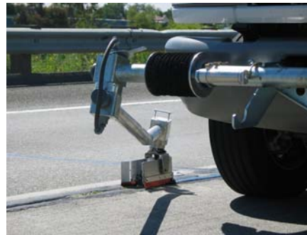
TTLS Sealing Shoe

The applicator bar should be heated before repositioning is attempted. This allows the joints to move freely making it easier for the operator to reposition the applicator bar and protects the internal heating elements. A safe method of insulating the applicator bar was an important design consideration to mitigate the potential of burns when folding. The applicator bar design chosen for the TTLS uses a double shell approach. The internal sealant passage is comprised of a copper tubing passage with brass rotating flange joints. The outer casing consists of steel and aluminum pipe with connector swivel blocks. The outer casing provides the required rigidity and mounting surfaces and the inner shell is the heated sealant passage. An air gap is maintained internally between the inner and outer shell as an insulating layer. The inner passage can be hot while the outer casing remains cool to the touch. Additionally the outer casing is all metal and therefore very rugged. Spring pins lock into detents in the casing blocks to configure the applicator bar in position. Pushing down on the handles allows the joints to rotate freely to reposition the applicator bar.