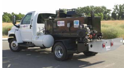
Auxiliary Engine & Hydraulic Pump

A 25-horsepower auxiliary engine powers the hydraulic systems on both the TTLS truck and transfer trailer. The engine is capable of running on either propane or gasoline fuels. To minimize pollution concerns, propane fuel was the first choice of fuels whenever possible. The transfer trailer has propane as the only fuel source, therefore the auxiliary engine on the trailer operates on propane fuel. The propane version of the truck engine was not available at the time of purchase, so a gasoline version was considered the second best option. Therefore, the auxiliary engine on the truck can be operated on either fuel. The engine creates more horsepower on gasoline, so the engine is currently operating on this fuel, but it can be converted easily and quickly to propane upon request from Caltrans. This engine has an internal 12Vdc 15-amp alternator, which is used to supply operational power and to keep the system battery charged. Both auxiliary engines also utilize output shaft mounted alternators. The trailer version utilizes a 12Vdc 70-amp alternator to provide additional system operational power. The truck version utilizes a 24Vdc 60-amp alternator to power the electric application bar heaters. Any additional 12Vdc operational power required by the system is supplied by the dual alternator option that was purchased on the truck engine. For this reason the truck engine should be running when operating the TTLS truck kettle for extended periods.