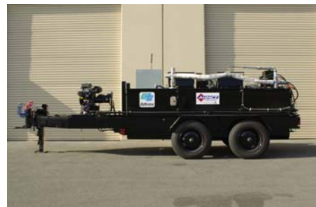
TTLS Transfer Trailer

The TTLS transfer trailer serves only one purpose, to provide a supply of hot sealant to refill the TTLS truck tank. The trailer does not have a sealing hose, or wand attached that can be used to directly seal cracks. Instead, the trailer only has a transfer hose designed to transfer its load of hot sealant to refill the truck tank quickly and safely. The transfer trailer is a fully self-contained large capacity hot applied sealant melt and transfer system consisting primarily of a 600-gallon sealant kettle. The considerably larger size of the trailer kettle compared to that of the truck is to boost sealant melting recovery time. The kettle is attached to the trailer with load sensing mounts so the sealant level in the kettle can be accurately monitored by the PLC. The TTLS transfer trailer runs completely on propane fuel that is supplied by dual external cylinders. The trailer kettle is loaded manually with standard sealant blocks through two non-splash hatches. The trailer kettle has a low profile design to provide for easy block loading from the ground. The entire