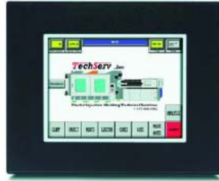
TTLS Common Display Panel

designed to integrate with the PLC selected for the TTLS project. The display is designed for industrial applications and is very rugged. Unfortunately, the EZ display was not designed to operate in direct sunlight. Like all other commercially available PLC display panels, direct sunlight operation is not recommended and can cause damage to