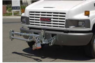
Applicator Bar Stowed For Transport

would reliably hold the shoe arm up. It became standard Caltrans practice to add a tie strap of wire, rope, or rubber bungee, to ensure the arm remained stationary when driven. The new design would have a lifting mechanism that would automatically lock in the retracted position, so even in the event of loss of air pressure the arm would