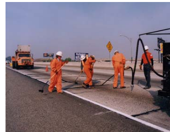
Hand Operation Sealing All Cracks

The ultimate goal of the development of the LCSM program has always been the design of a machine capable of moving lane closure operation. This feature has several major benefits and produces dramatic cost savings. By not establishing lane closures traffic congestion is reduced, operational time on the highway is increased within the traffic window, and cracks in areas where fixed work zones are not practical can be sealed. The labor costs for establishing fixed lane closures is a large part of the cost of a crack sealing operation. By reducing or eliminating the need to establish fixed lane closures, generous cost savings can be realized. In addition, not requiring a crew to go out on the highway to establish a fixed lane closure, worker exposure is reduced providing a safety benefit as well. To maximize these benefits, new features would be incorporated into the new machine design that would further develop the abilities to conduct longitudinal crack sealing operations on the highway in moving lane closures.