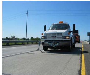
TTLS Initial Testing in District 3

deployed through Caltrans Division of Maintenance for statewide operation. The intent of the new design was to mitigate several minor functional issues that surfaced with the existing equipment in the field, but would primarily focus on the development of a vastly increased hot sealant supply to meet the high production demand created when utilizing the LCSM. This new system, the Transfer Tank Longitudinal Sealer (TTLS) creates a continuous hot sealant supply for high production sealing operations by developing a hot sealant transfer from nurse kettles scheme. The TTLS system consists of two separate machines that were developed simultaneously. The application truck is a self-contained high production highway longitudinal crack sealing machine. The transfer trailer serves the role of a nurse kettle by providing large amounts of hot sealant and high speed transfer capabilities to quickly re-supply the application truck. Other machine advances include incorporating a sophisticated controller to mitigate operator training issues and total in-cab machine operator control to allow for moving lane closure highway sealing operations. The new machine prototype would also be developed in such a manner as to enable Caltrans to reproduce the machine through subcontract or through direct vendor purchase.