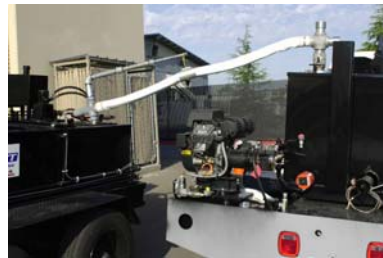
TTLS Hot Sealant Transfer