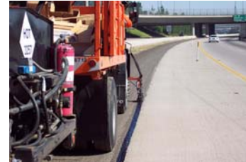
LCSM2 in District

The LCSM2 was typically driven along the shoulder of the highway sealing the edge cracks. Increasingly these operations had Caltrans Maintenance crews sealing these edge cracks without closing traffic lanes when the shoulders were wide enough. The advantages of not establishing lane closures for crack sealing operations are numerous and unique to a LCSM operation. Establishing a lane closure requires a fair amount of time and labor and restricts traffic flow. Savings realized by reducing the necessity for fixed lane closures can be quite significant. A cost analysis was conducted in District 11 comparing LCSM2 operation to the traditional hand sealing operation (see appendix A).