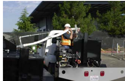
TTLS Transfer Hose

The transfer hose is the conduit that connects the TTLS trailer to the truck kettle for transferring hot sealant. Since the applicator truck is mobile and operates independently, a simple connection method had to be developed that did not require the truck to physically mate with the trailer. The goal was to develop transfer hardware so the application truck need only to be parked near the trailer for filling. Since transfers rarely take place on perfectly flat surfaces, the transfer connection had to be flexible enough to adapt to unpredictable positions and orientations of the truck. To meet these requirements a flexible hose was selected over a rigid swivel pipe design. The transfer hose can be easily aligned and coupled anywhere within reach of the hose. The transfer hose couples to the top of the trailer tank for storage and recirculation. For truck transfer the hose is decoupled from the trailer and swung over to the truck and coupled to a fill spout on the top of the truck tank. Since the truck tank is a couple feet higher than the trailer, the transfer hose is attached to the trailer via a rotating coupling mounted at an angle, so as the hose swings it also gains height. A support arm supports and swings with the hose.