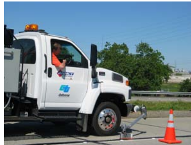
TTLS Ergonomic C-Series Cab

Conducting sealing operations off either side of the truck has become a required condition for a LCSM, therefore the new C-Series cab would have to have dual steering. Since the new C-Series was in its first year of production by GMC, custom options were unavailable and dual steering was obviously not a standard option. The Monroe Truck Parts company, which has a strong association with GMC was contacted in order to obtain a dual steer modification. Monroe Inc. had not engineered a dual steer option for the new C-Series, but they were interested in allowing this to be the first. The modification proved to be far more difficult than initially predicted adding to the delayed delivery of the modified truck by a year.