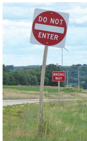
Warp appears to be more common, or at least more visible, in single-post than two-post signs.