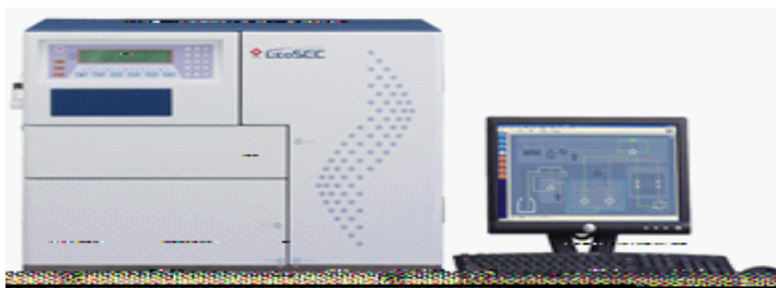
Tosoh EcoSEC high performance GPC system (HLC-8320GPC)

The project was sub-divided into two phases including (I) the purchasing, installing and calibrating of a Tosoh EcoSEC high performance GPC system (HLC-8320GPC), shown below, at the DOTD Materials Laboratory and conducting tutorials regarding detailed procedures for conducting binder analysis to determine the percentage of polymer content in polymer modified binders; and (II) developing more efficient extraction processes capable of recovering asphalt from CRM asphalt cements. A catalog containing