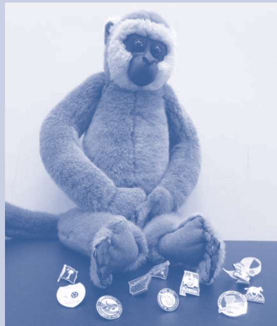
With each state Albert visits, a new pin is added to his collection.

to Huntsville, Alabama—home to the NASA facility where much of America’s space program has been planned—he was named Albert in honor of the first monkey sent into space.