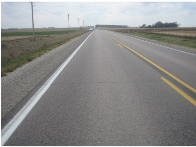
Pavement survey location on County Road E-67

Although beyond the scope of this study, the identified economic value of WMA technology is due to the reduction of plant temperatures by 50 to 100°F, fuel savings, the improved field compaction allowed (reduction in roller coverage), and/or shorter haul distances. The environmental benefits of WMA additives include reduced HMA plant emissions because of the reduced plant production temperatures, as well as reduced worker exposure to fumes during the production/construction process.