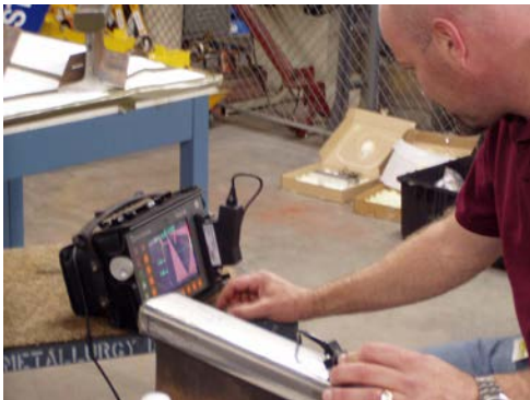
Figure 2-Phased Array Analysis

The initial ultrasonic scanning evaluations discussed in this report were performed on 136 pound/yard rail sections. The samples scanned included rail with and without flaws. The flaws in the rails were either service induced or artificially machined into the railhead (Figure 2).