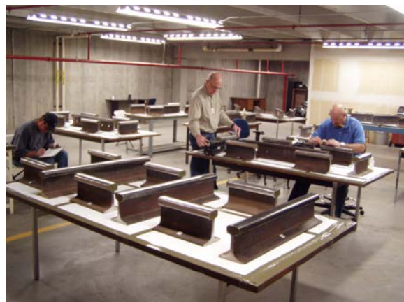
Figure 1-Scanning of RF-LOAD

This research focused on the development of rail segments with manufactured, artificial defects (herein referred to as master gauges), collecting field defects, and baseline quantification of rail flaw sizing using conventional and phased array ultrasonic testing approaches. Future phases will involve expansion of the RF-LOAD to include different orientation of defects and data analysis utilizing new developments in ultrasonic testing techniques.